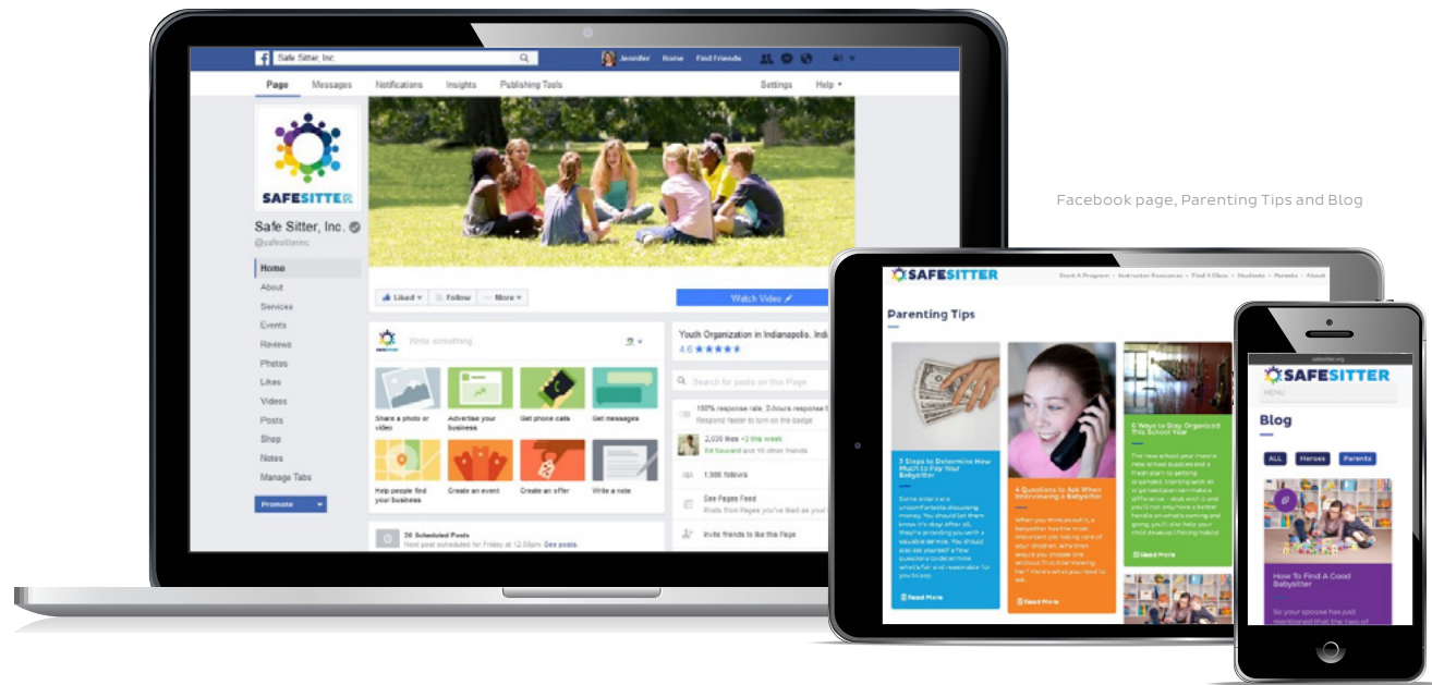
Facebook page, Parenting Tips and Blog

Blogging for businesses has also become a growing expectation in today's digital world. People expect to find the info they're looking for with minimal effort, and for it to be presented in an easy-to-read, "bite-sized" format. And that's how we're committed to delivering it. We now have website pages devoted to providing Teaching Sites with advice on running a successful Safe Sitter® program and for parents to give them tips on parenting their tween, hiring a babysitter, and more.