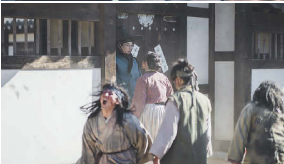
(from left) Yoo Jae-suk, Kwon Yuri and Lee Kwang-soo.