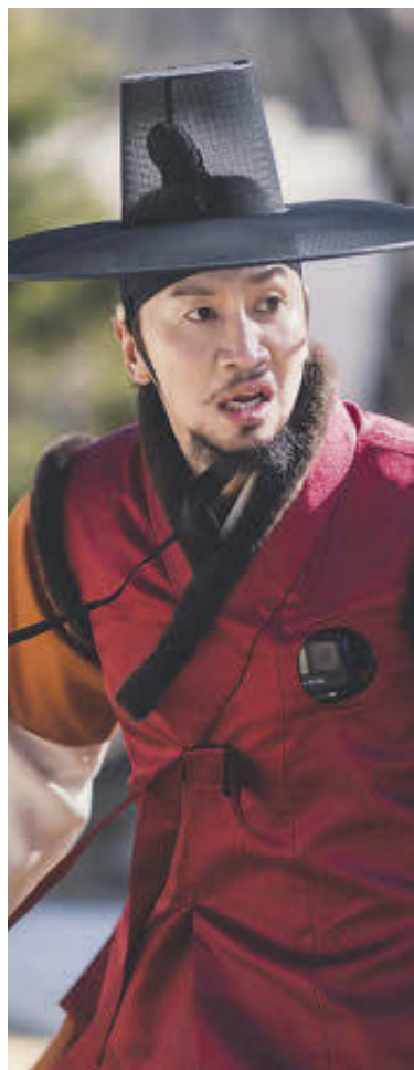
Actor Lee Kwang-soo during the zombie challenge.