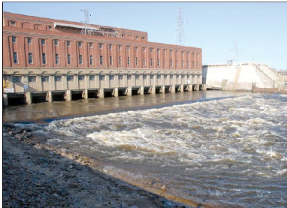
People will have the opportunity to tour the Prairie du Sac Dam Sept. 23-Sept. 25.

The tours will take place from 3 p.m. to 6 p.m. Friday, Sept. 23, and 9 a.m. to 3 p.m. Saturday, Sept. 24, and Sunday, Sept. 25. Tour directors will include re- — SEE DAM, PAGE 7