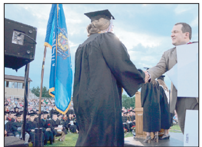
Sauk Prairie High School graduates were all smiles as they accepted their diplomas during the 2016 graduation ceremony on June 3 at the school. It was an evening of celebration while honoring accomplishments as the graduates enter a new chapter in their lives.