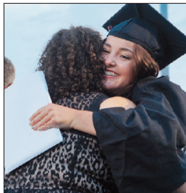
Scenes from the 2016 Sauk Prairie High School graduation on June 3 show graduates celebrating their special day. More photos from the ceremony can be found inside this edition of the Star .