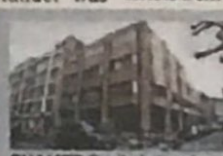
SHAMED Capita in London

The intended recipients of results should have received at least one notification from a GP or screening clinic – women with abnormal results require letters from two or three sources.