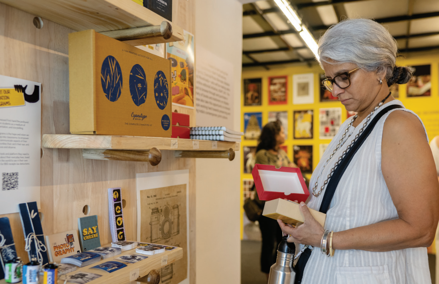
Visitors at the independent publishers' space within "Text/Matters".