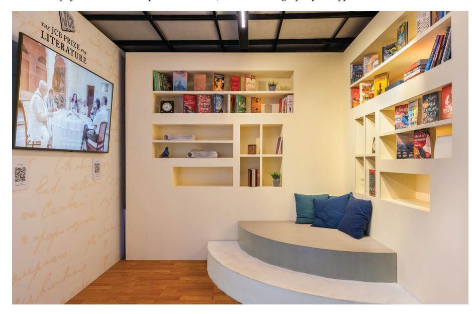
The JCB Literature Foundation showcase within 'Text/Matters'.