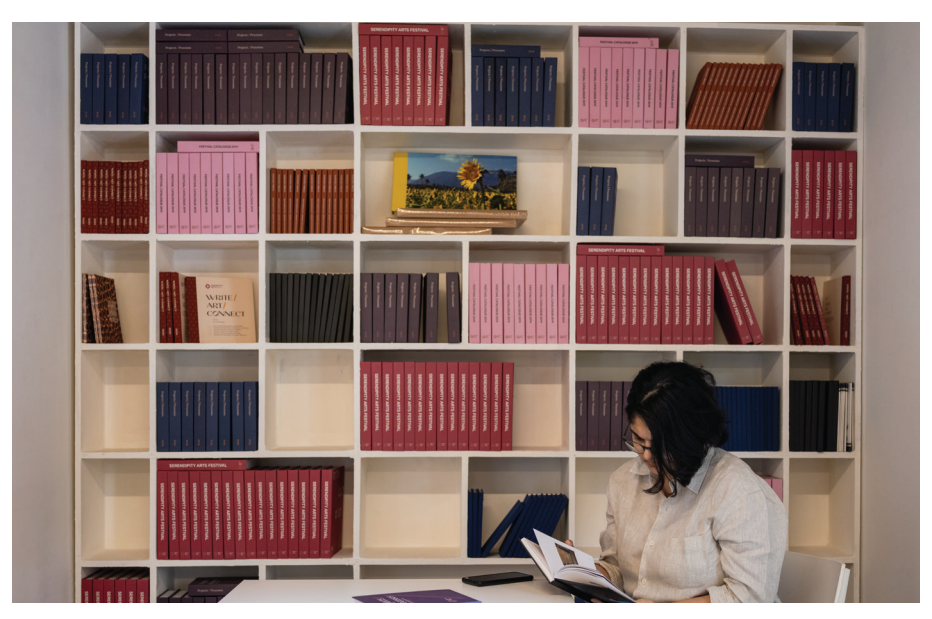
The Serendipity Arts Foundation space within 'Text/Matters'.

At the other end of the tour, through its spotlighting of notable works of contemporary Indian fiction including translations from seven languages and its hosting at the