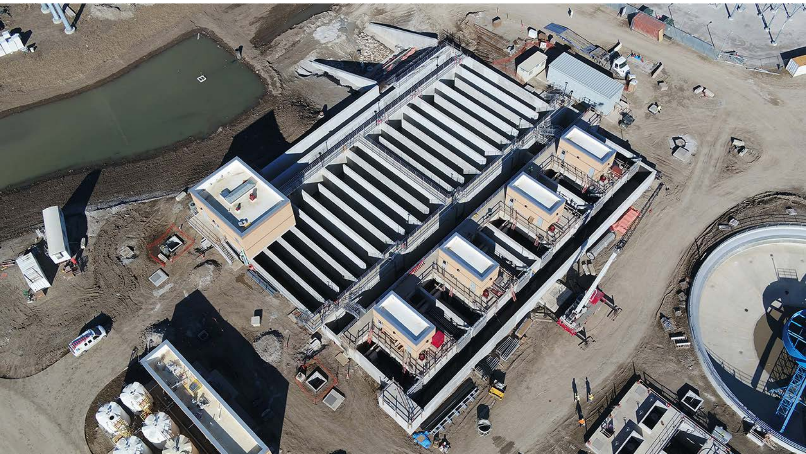
Filter and disinfection complex, March 1, 2021

The new facility will provide multiple environmental benefits to the area, including how it will improve Tomahawk Creek's and Indian Creek's stream health. It will feature dual purpose filters to provide enhanced nutrient removal for phosphorus and nitrogen, as well as treating peak flows during wet weather events. These nutrients promote algae growth, which can impair the stream. By enhancing the stream, JCW not only protects aquatic life, but it is also good for the community. Improved nutrient removal provides near and far field stream benefits and addresses nutrient impairments in Indian Creek and beyond. The increased effluent flows