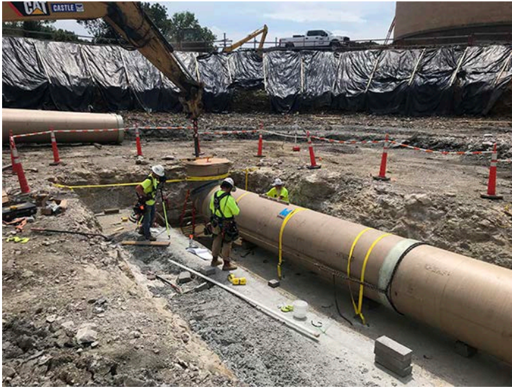
Piping, August 20, 2019