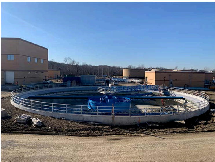
Final clarifiers at ground level, March 4, 2021