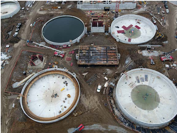
Final clarifiers, March 17, 2020