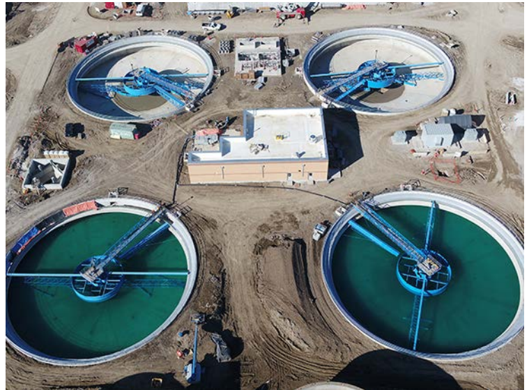
Final clarifiers, March 1, 2021