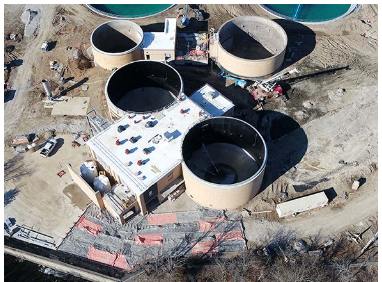
Digesters, March 1, 2021