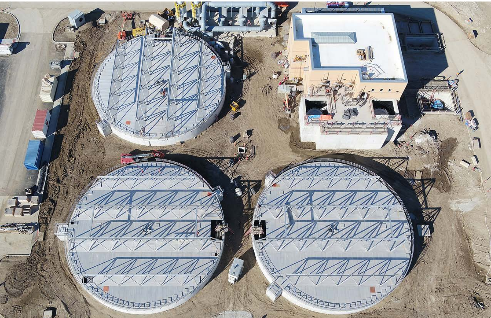
Headworks and primary clarifiers, March 1, 2021

effluent quality standards, successful projects such as the Tomahawk Creek Wastewater Treatment Facility expansion prove that innovations, creativity, and a solid team mentality can achieve great savings for the public and improved services. As JCW embarks on other large-scale, complex projects to maintain and improve the county’s wastewater system, lessons learned from this experience are sure to benefit residents, in many ways, for generations to come.