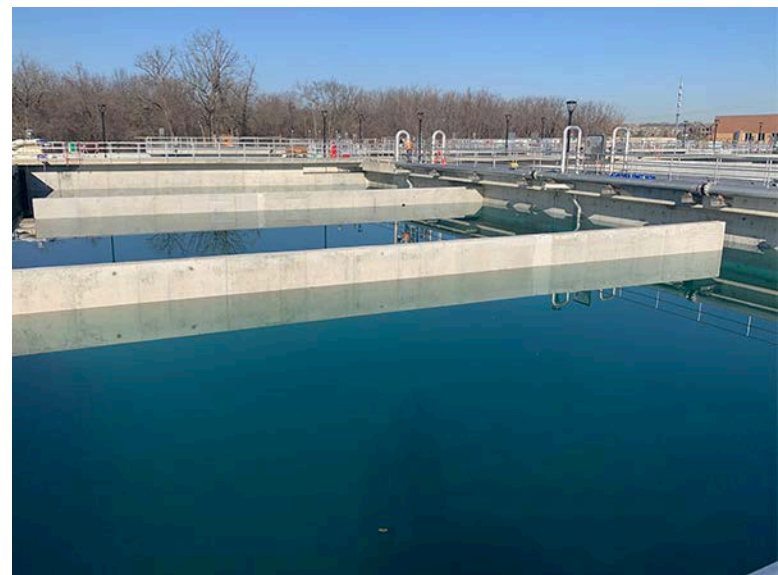
BNR structure, March 1, 2021

This is the largest infrastructure project that Johnson County has undertaken to date, and it is significant for a number of reasons. First, as part of the project a new National Pollutant Discharge Elimination System (NPDES) permit was negotiated with the State of Kansas for the Tomahawk facility that included peak wet weather