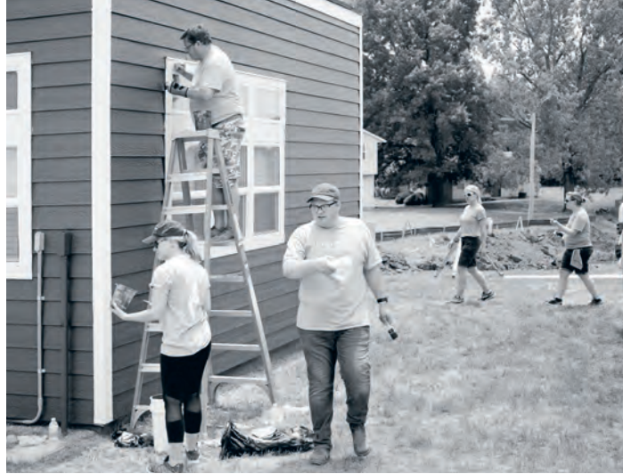
DEMDACO colleagues work together on a community project as part of our 2018 company-wide day of service.

Community involvement is an important way that we measure whether we are lifting spirits. It might be with a financial donation to an organization or a product donation for a fundraising event. It's also the way our colleagues use their community time off. Each year, DEMDACO colleagues receive five paid Lift the Spirit Days to volunteer at the organization of their choice. It is one of the ways we believe best demonstrates our Lift the Spirit mission. Both the DEMDACO colleague and the community benefit.