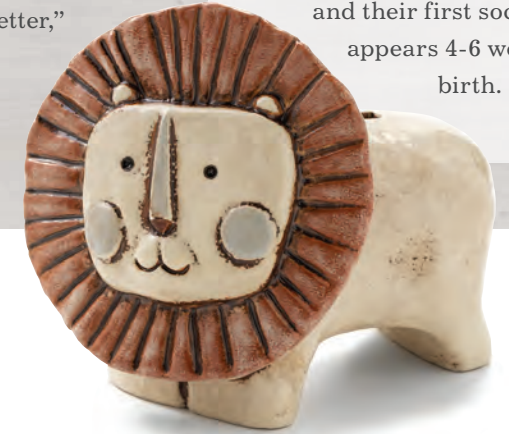
Noah's Ark Lion Bank 5004700781 $25