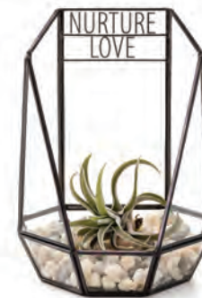
Nurture Love Terrarium (plants and rocks not included) 1004510022 $46