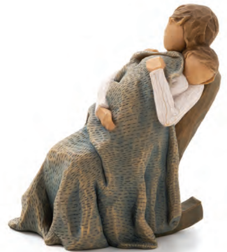
The Quilt 26250 Sleep my child and peace... peace... Covered in love and keep... keep... $38