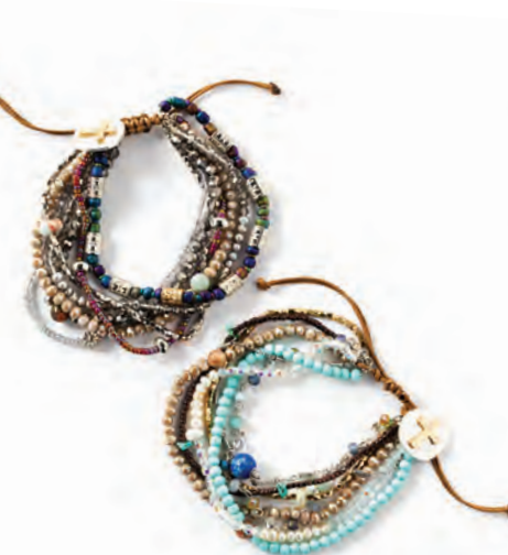
Your Journey Prayer Bracelets Gray 1004000123 Turquoise 1004000129 $24 each

The destination Will provide its own rewards But the true gift is in YOUR JOURNEY