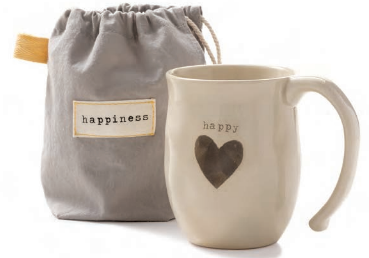
Happy Heart Mug Comes ready-to-gift and designed to keep hands toasty. 1004470023 $18