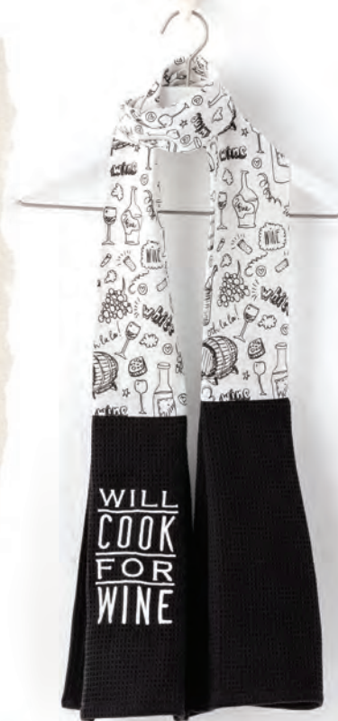
Will Cook for Wine Kitchen Boa 1004180084 $22

brainchild of that philosophy. With the dish towel tucked neatly around the neck, instead of precariously tossed over the shoulder, this all-important kitchen tool is handy, clean and worry-free.