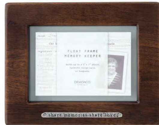
Share Memories Recipe Card and Photo Display 1004260036 $34