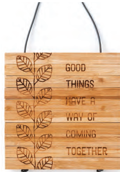
Good Things Expandable Trivet, Makes beautiful wall art when not in use. 1004180381 $24