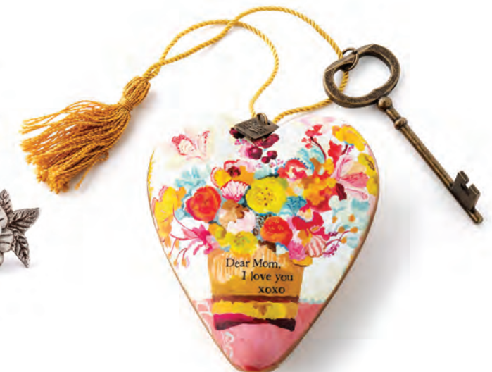
Dear Mom Art Heart Heart can hang on the wall or stand on key easel. 1003480057 $17