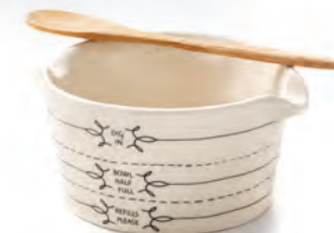
Fill Me Up Appetizer Bowl with Spoon 1004180372 $17