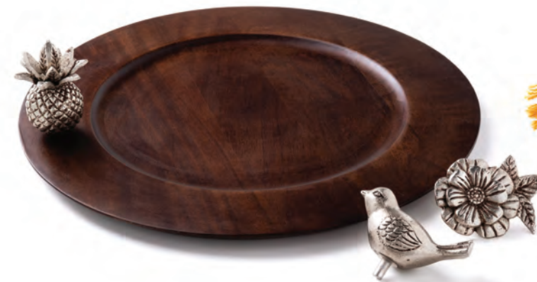
Mango Wood Platter and Tokens Display for different occasions with interchangeable tokens. 1004260066 $46 Pineapple Token 1004260068 | Bird Token 1004260090 | Flower Token 1004260070 $11 each