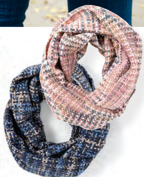
Your Journey Infinity Scarves Pink 1004290093 Blue 1004290094 $29