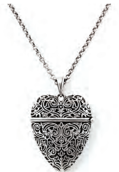
Story Heart Pendant – Best Mom Ever 1004130061 $30