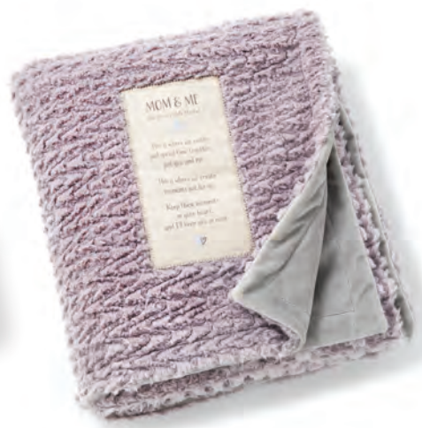
Mom and Me Cuddle Blanket 5004700736 $45