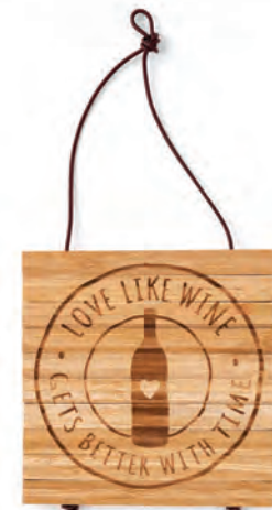
Love Like Wine Expandable Bamboo Trivet 1004180385 $24