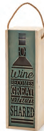
Wine Becomes Great Gift Box & Lantern 1004080127 $22