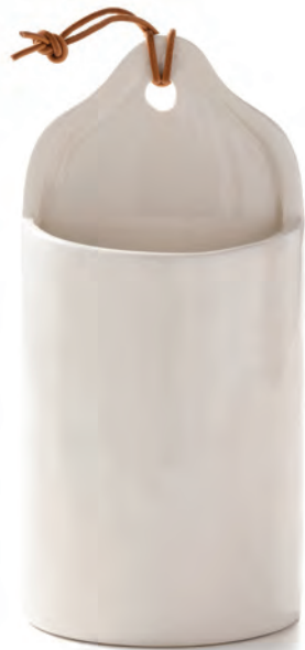
Tall Ceramic Crock Stores utensils, flatware, plants and more. 1004180322 $28