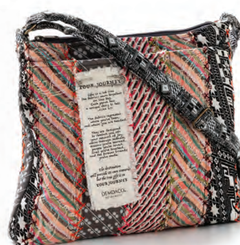
Your Journey Cross Body Bag 1004450004 $39