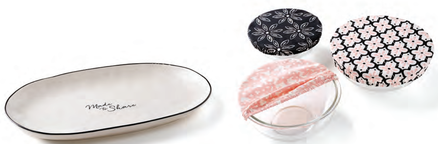
Made to Share Stoneware Platter 1004100024 $46