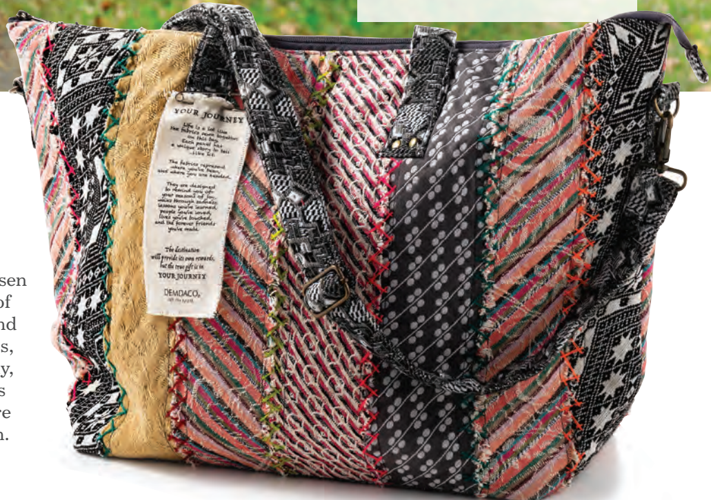
Your Journey Overnight Travel Bag 1004250123 $75

Each bag is hand-stitched in India from distinctive fabrics chosen to represent different phases of life—bright and bold, or soft and muted. You may find variations, though in the same color family, on the bag you receive. This is intentional to remind us we are not all cut from the same cloth.