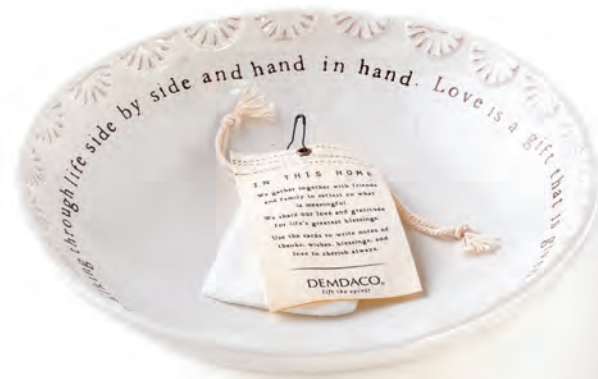
Love is a Gift Decorative Bowl 1004260082 $36