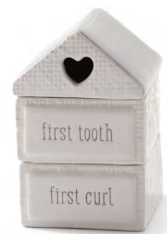
My First Tooth and Curl Box 5004700835 $16