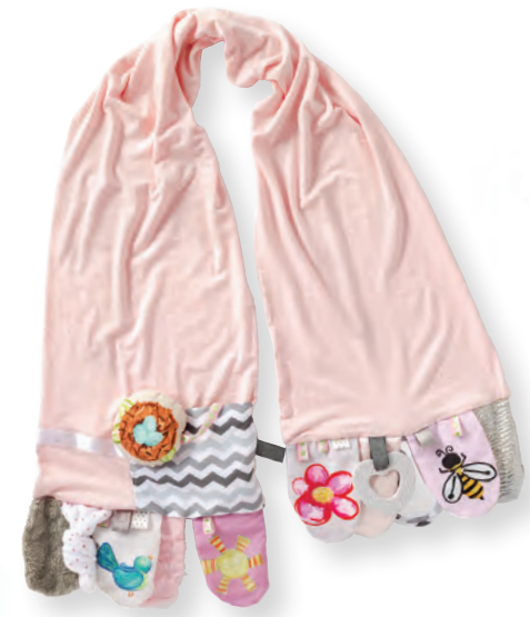
Pink Mommy & Me Activity Scarf 5004700692 $38