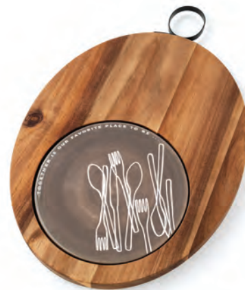
Large Acacia Wood Serve & Cut Board and Forks Spoons Knives 3-in-1 Trivet 1004180393, 1004180361 $68 (board), $19 (trivet)