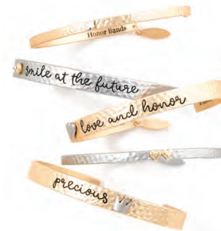
Honor Bands Cuff Bracelets $20 each

Hummingbird Nature (1004250095) | Palm Floral (1004250093) Rectangle Scarves, $24