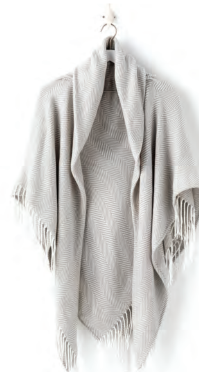
Comfort Collection Blanket Wrap 1004290129 $45