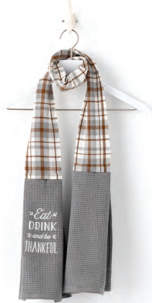
Be Thankful Kitchen Boa® A handy, clean and worry-free kitchen tool. 1004180285 $22