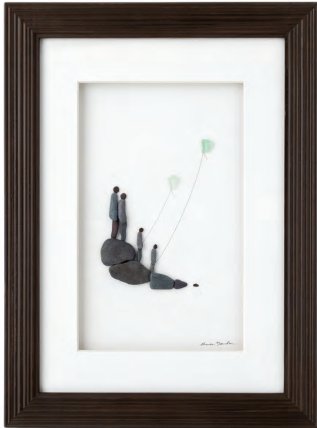
Time Together Wall Art 1004370009 $54