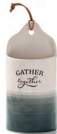
Gather Together Ceramic Crock 1004180316 $28