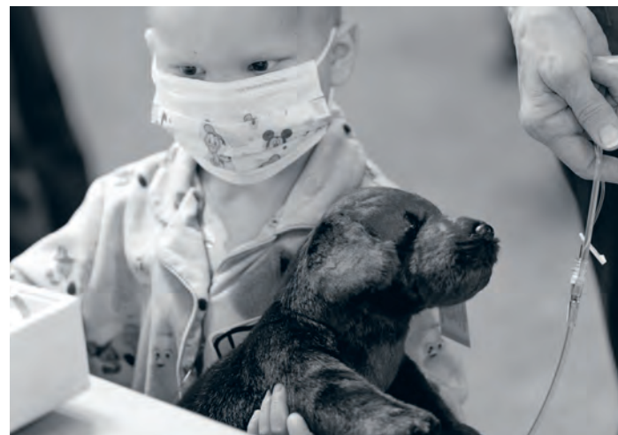
Children's Mercy patients browse for gifts at the 2018 DEMDACO holiday shop.