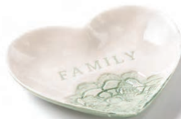
Family Treasure Keeper 1004500025 $8.00