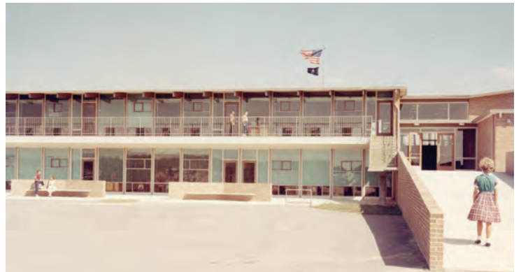
Osage Elementary, Overland Park — demolished now — was designed by Boyle and Wilson Architects, who also designed two other modern elementary schools in Johnson County.