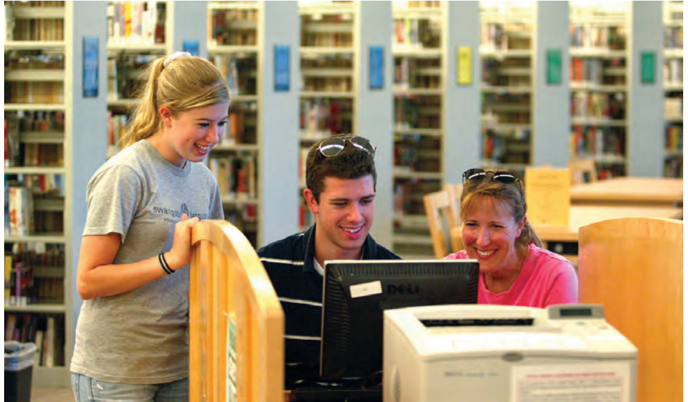
A Johnson County mom and her two high schoolers find successful help on Tutor.com at Blue Valley Neighborhood Library.

Coaches can also connect students to the very popular "Live Homework Help" resource from Tutor.com. This free, live,