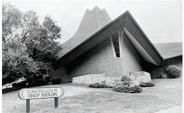
Congregation Ohev Sholom in Prairie Village was completed in 1969. Architect Manuel Morris gave the building a distinctive sloping roof.

WEB EXTRA Learn more about the exhibit and view more examples of Modernist architecture in Johnson County at www.jocogov.org/jocomag