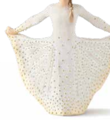
Butterfly Resilient, determined, courageous and beautiful... You have the qualities to transform your world v I $39.00