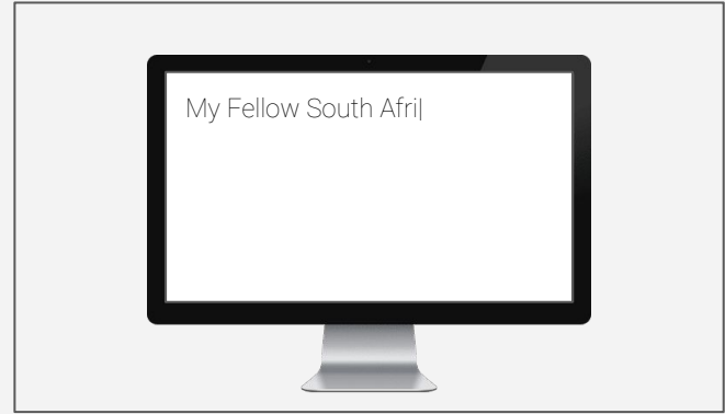
Shot 2: We hear typing. Someone is writing an important speech. From what they're typing, we can see it's our President.