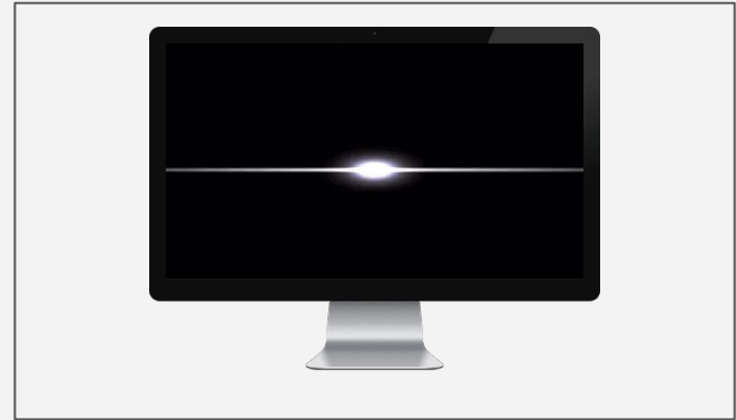
They're hit with loadshedding. Male VO: Ah! Ah! Ah! Banna!