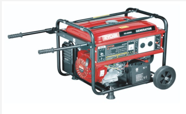
Shot 6: Offer #1