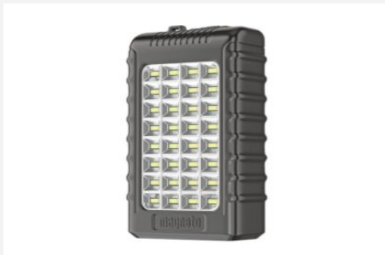
Shot 7: Offer #2

VO: Put an end to loadshedding, with immediate effect! Shop our latest offers on generators, portable lights, and more!