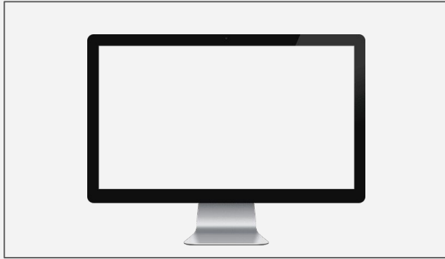
Shot 1: Open on a laptop screen.