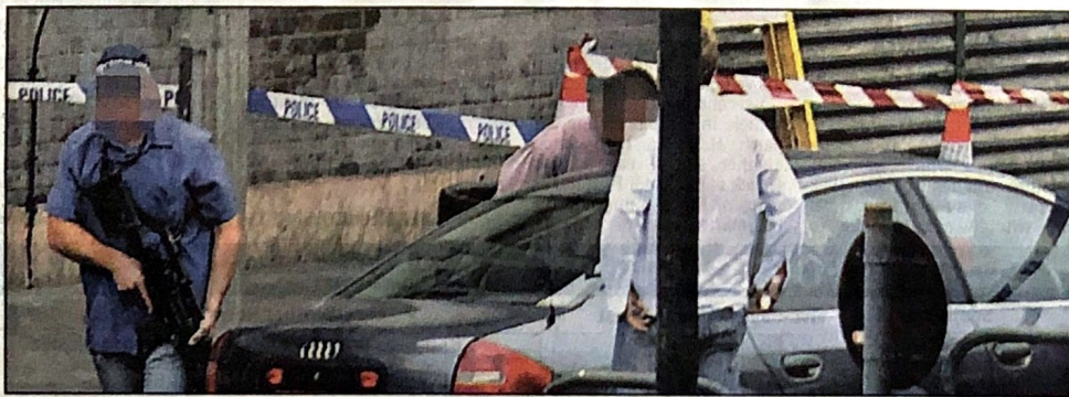
Aftermath: armed police at Stockwell station following the shooting. Report details a catalogue of errors by officers involved in operation