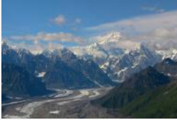
Glacier Tours with K2 Aviation