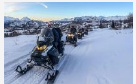
Snowmobile Tours w/ AK Backcountry