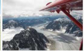
Flight-seeing with Alpine Air