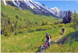
Mountain Biking w/ AK Trail Guides