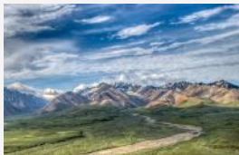
Denali National Park