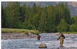
Fishing outside of Anchorage