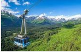
Gondola Rides at Alyeska Resort