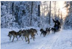
Dog Mushing Tours w/ husky adventures