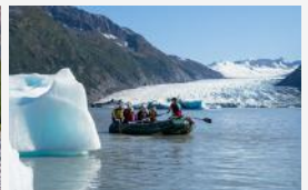
Kayaking & Rafting