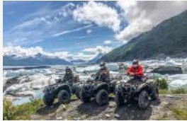
Glacier ATV Tours w/ AK Backcountry