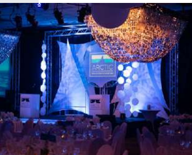
GALAS | FUNDRAISERS