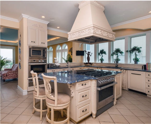
From top: The exterior of 114 S. Nashville Ave. in Ventnor; the kitchen inside the home is perfect for entertaining thanks to a center stove and island; the exterior of 1900 Deer Run boasts a stone facade and a four-car garage.