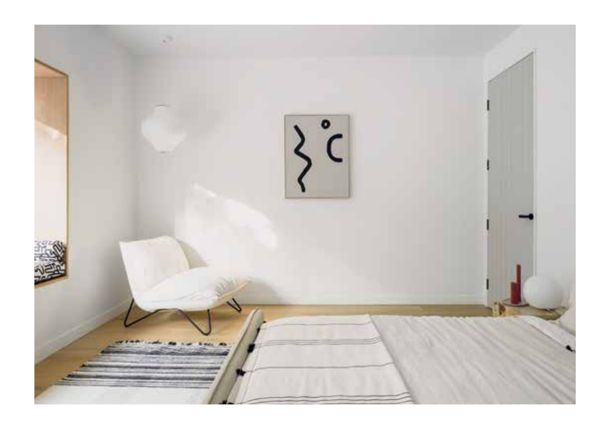
The guest quarters — two bedrooms, each with their own ensuite and balcony — are accessed via the staircase and a landing bridge, an arrangement that allows visitors to privately come and go from their own secluded spaces.