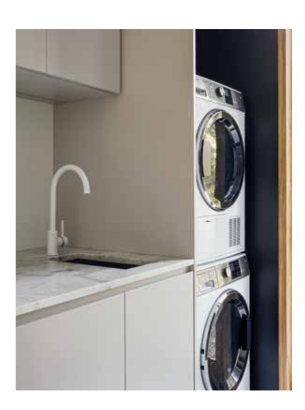
ABOVE LEFT A Fisher & Paykel Series 9 16cm, 85L, 16-function, self-cleaning oven with moisture-level control via ActiveVent technology makes light work of meal prep opposite a Fisher & Paykel French door fridge with a chilled water dispenser and ice maker, and beside a Fisher & Paykel 90cm 5-zone induction hob and 90cm integrated rangehood with stainless steel filters. ABOVE RIGHT Space is expertly utilised in the adjacent pantry, which doubles as the laundry thanks to a sink/tub and a Fisher & Paykel 11kg front load washing machine stacked with an 11kg condensing dryer. The washer's ActiveIntelligence technology removes the guesswork by tailoring detergent doses and adjusting wash times to suit each load, while the dryer is incredibly gentle on fabric and handily doesn't require external venting. BELOW "Starting with such a beautiful garden setting made us want to maximise the use of the garden and decks, so the whole living experience feels more expansive," says Adam. Pictured here are spaces on the upper storey, which link to their own private balconies. OPPOSITE The upstairs guest rooms.