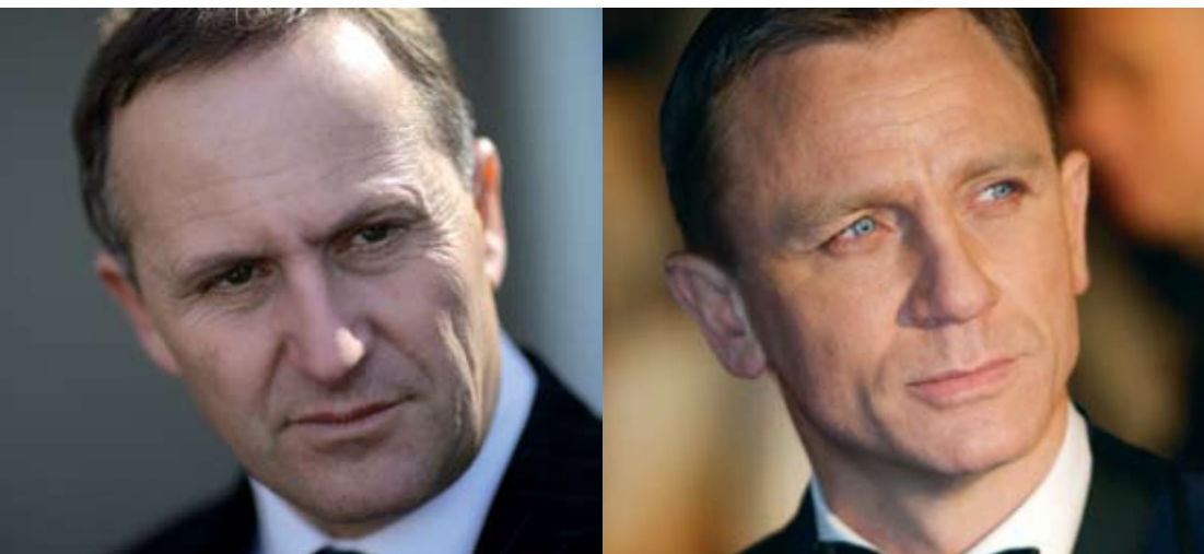
Prime Minister John Key and 007 Daniel Craig