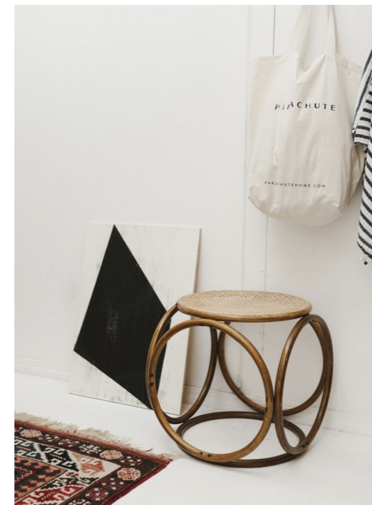
ABOVE That cobalt bathroom vanity does have a certain charm. The couple has spruced up this room with extras including a Torso bath mat by Cold Picnic and a mirror from Rejuvenation. LEFT This mid-century bentwood stool in the guest room was a happy find in a local antique store.