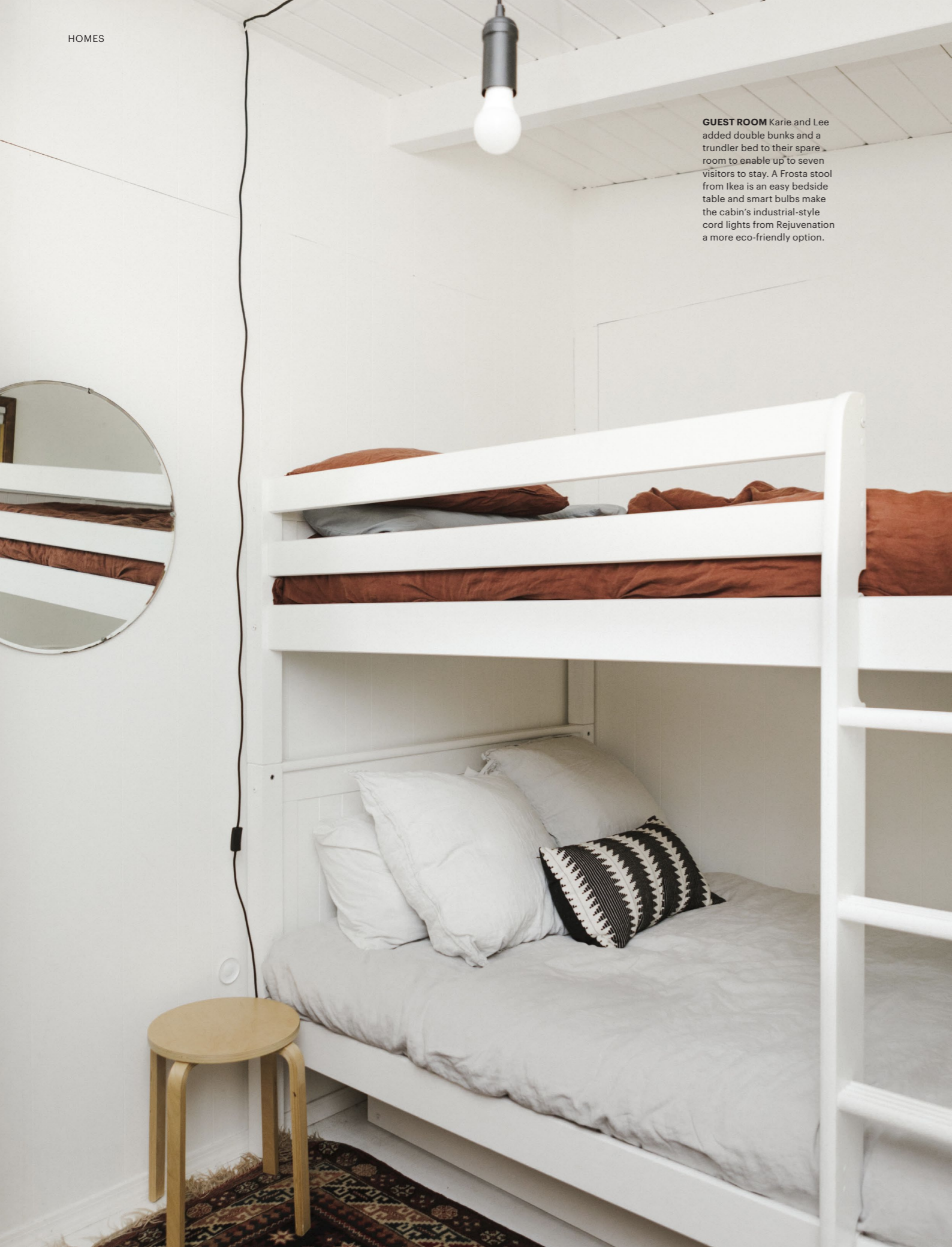
GUEST ROOM Karie and Lee added double bunks and a trundler bed to their spare room to enable up to seven visitors to stay. A Frosta stool from Ikea is an easy bedside table and smart bulbs make the cabin's industrial-style cord lights from Rejuvenation a more eco-friendly option.