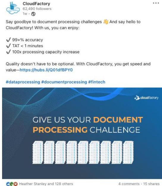
LinkedIn: 30-second motion graphic