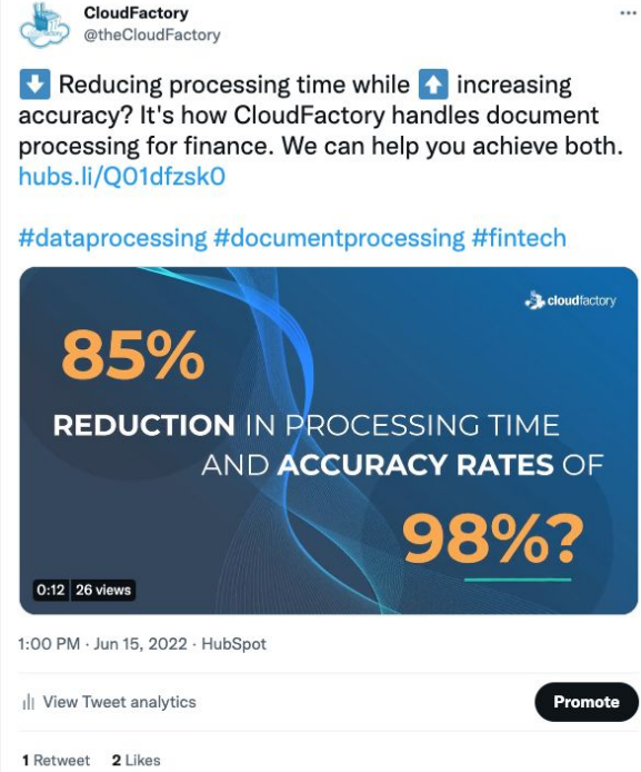
Twitter: 15-second clip