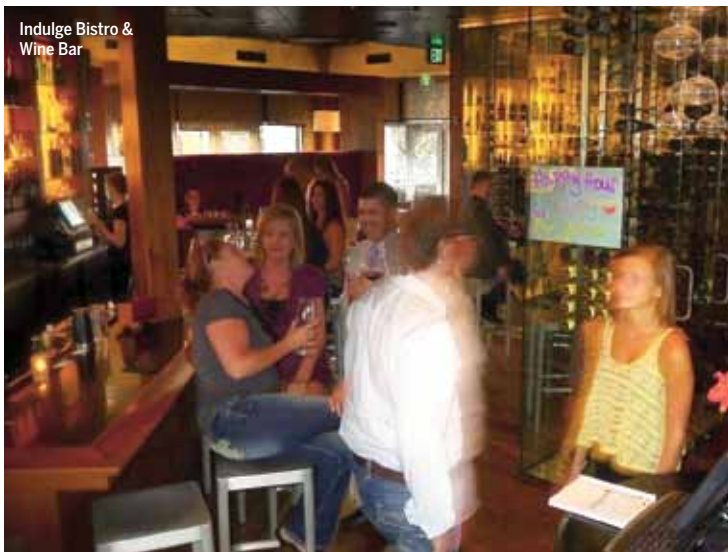
Indulge Bistro & Wine Bar