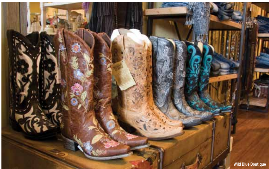
Wild Blue Boutique

5221 S. Santa Fe Drive, Littleton, stnicks.com