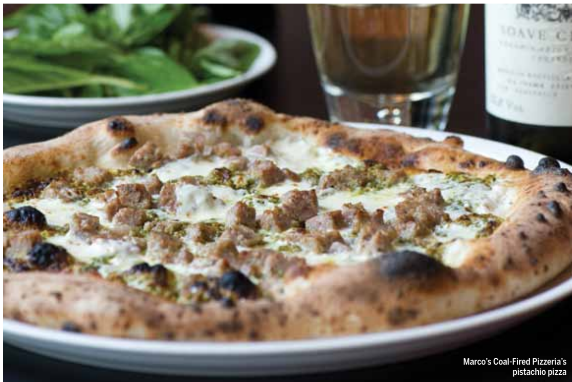
Marco's Coal-Fired Pizzeria's pistachio pizza

You'll find two equally delicious styles of pizza at the southern branch of Marco's Coal-Fired Pizzeria : Neapolitan (thin, Italian-style) and New York (thin, American-style) pies. Go for the lunch