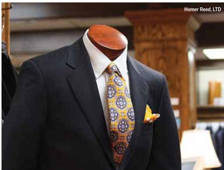
FROM TOP: COURTESY OF BLING; COURTESY OF JARED MOYRNE

4495 S. Broadway, Englewood, banistersflowers.com