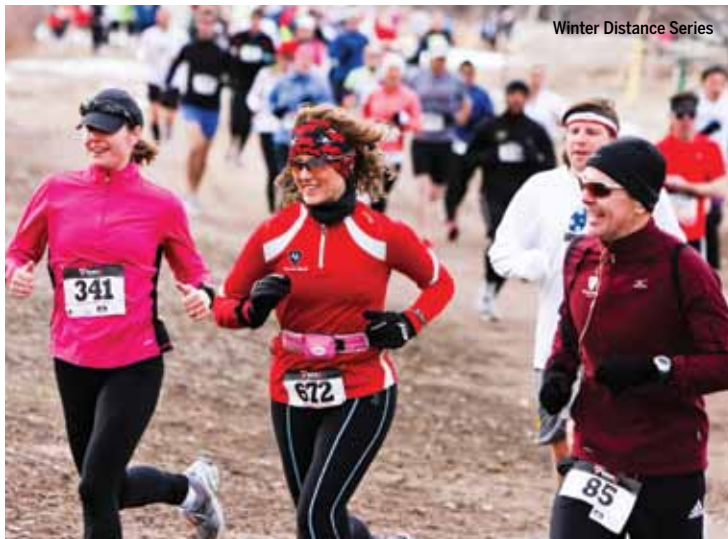
Winter Distance Series

Don’t be a couch potato just because the temperature’s dropped. Here, a few ways to keep your blood pumping.