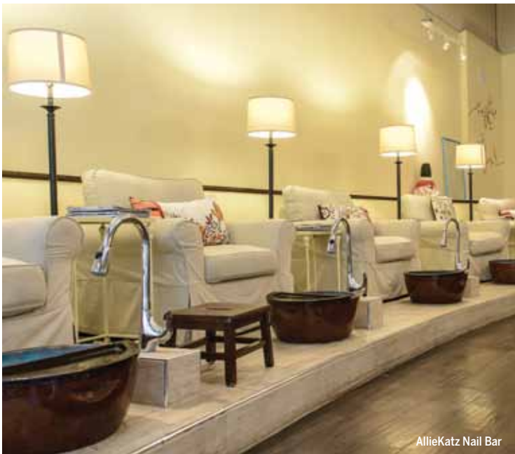
AllieKatz Nail Bar

Leave the real world (and parched winter skin) at the door when you step inside Spavia's tranquility room, which eschews pretension