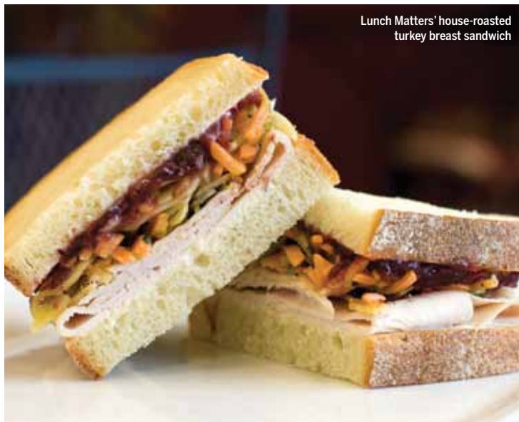
Lunch Matters' house-roasted turkey breast sandwich

lunchtime visit will set you back just $8.95 for an entrée and mini-appetizer. The shrimp toast is a hit.