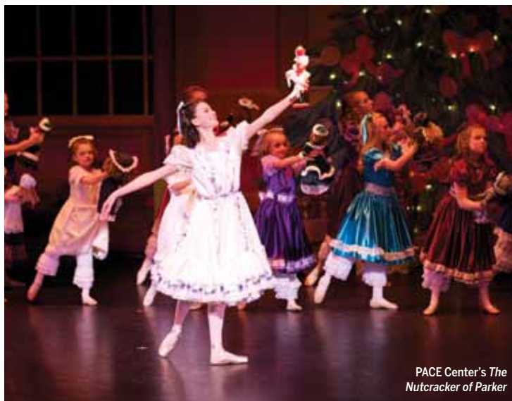
PACE Center's The Nutcracker of Parker