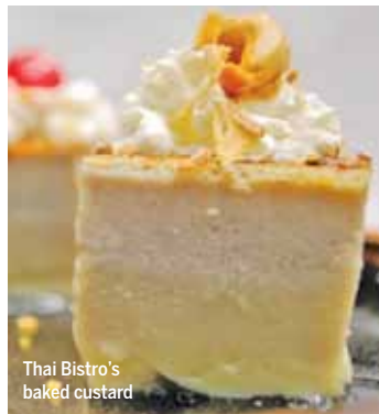
Thai Bisto's baked custard

Don't let the strip mall location fool you: The family-run, vegetarian-friendly Thai Bistro has been dishing out super fresh, authentic Thai cuisine in Littleton for 13 years. A