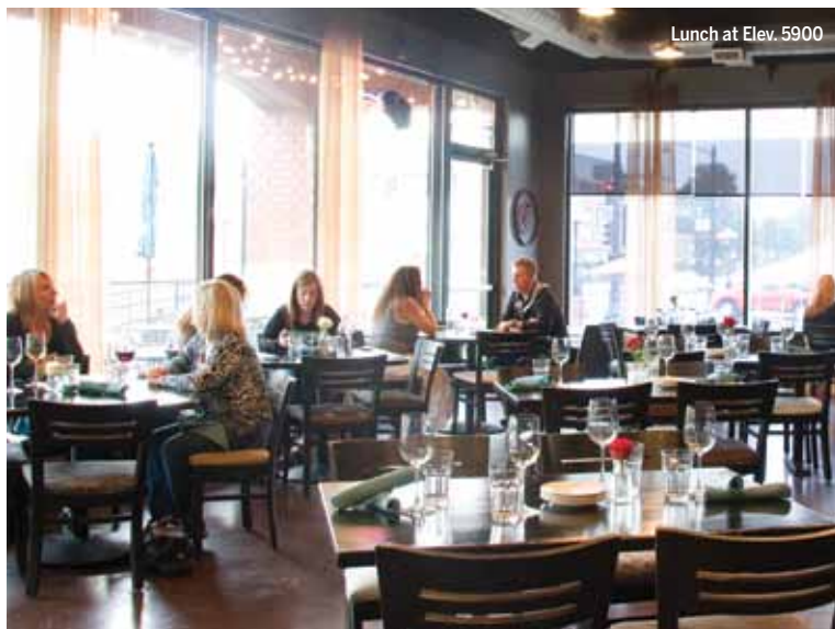
Lunch at Elev. 5900

FROM TOP: COURTESY OF CRAVE REAL BURGERS; ILLUSTRATION BY SEAN PRIBOSINS; AARIN REITER; OPPOSITE PAGE: AARIN REITER; COURTESY OF THE BISTRO