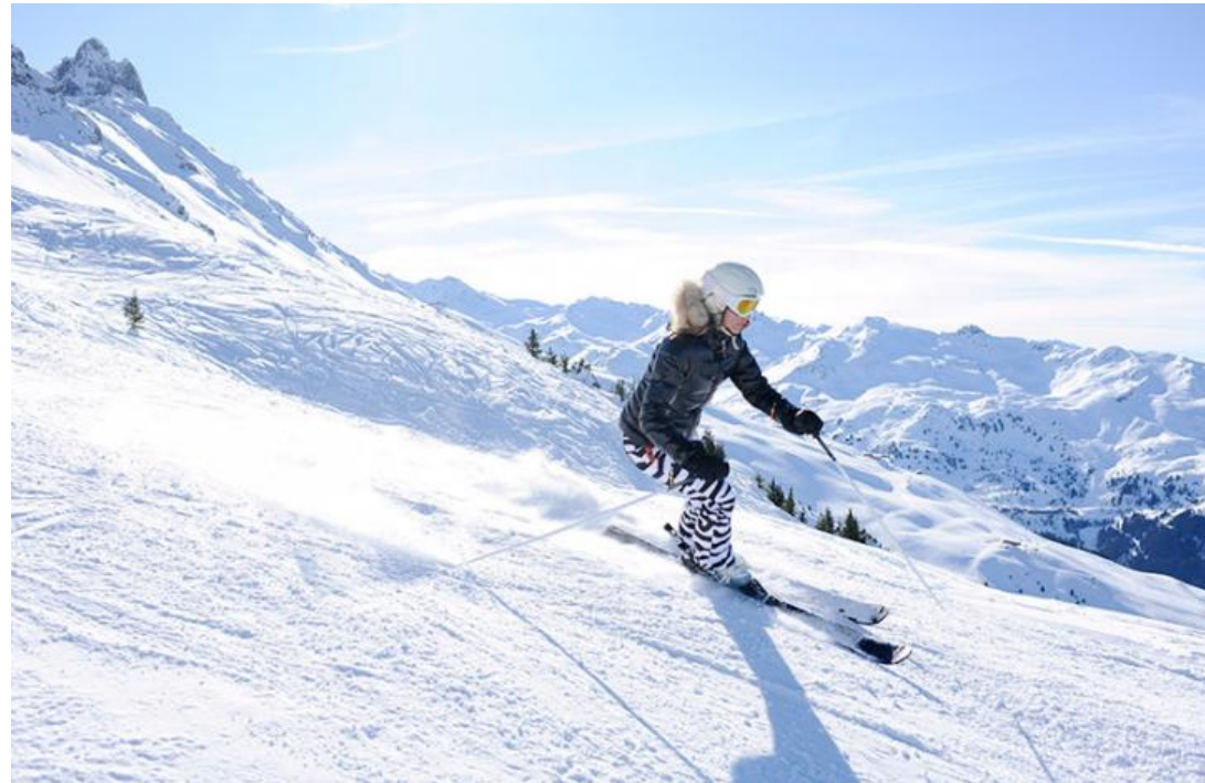
Les 3 Vallées, France

Vail Resorts 2014-2015 season passes are on sale now , and the sooner you buy, the more you save. And guess what? The Epic Pass pays for itself and more if you ski just six days at any of 11 mountains across Colorado, Lake Tahoe, and Utah next season. Bonus—and we mean big bonus: The Epic Pass is also your golden ticket to world-renowned ski resorts in Europe and—new for next season—Japan. Read on and check back here for details and updates on where you can go with your Epic Pass next season.