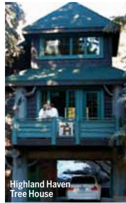
Highland Haven Tree House