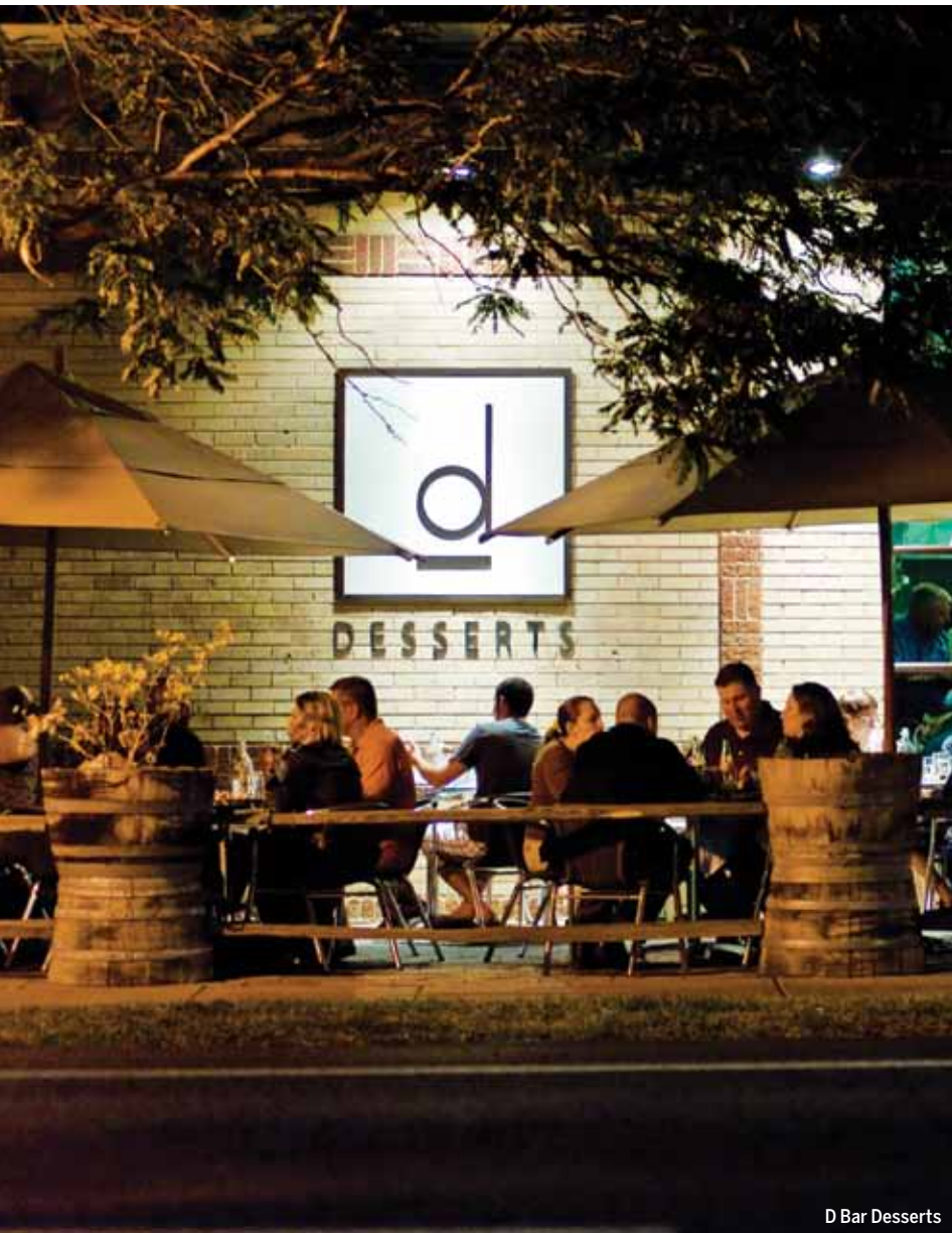
D Bar Desserts