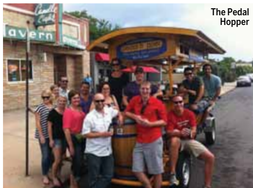
The Pedal Hopper

What you can bring aboard the Pedal Hopper are all the rehydrating beverages and snacks that you want. Stock up, especially during hot weather.