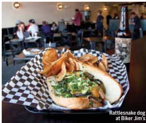
Rattlesnake dog at Biker Jim's

Make it happen: Denver Microbrew Tour, 303-578-9548, denvermicrobrewtour.com; Euclid Hall Bar & Kitchen, 1317 14th St., 303-595-4255, euclid-hall.com; Southwest Rink at Skyline Park, 16th and Arapahoe streets, southwestrink.com; Biker Jim's Gourmet Dogs, 2148 Larimer St., 720-746-9355, bikerjimsgods.com; Coors Field, 2001 Blake St., 303-292-0200, coloradorockies.com