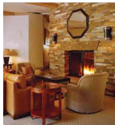
ASPEN'S LITTLE NELL

The word luxury is so overused in the travel business these days that it's often hard to discern over-the-top pricey from truly commendable indulgence. At Aspen's Little Nell , it's always the latter. True, you won't get out of this Ajax-adjacent, recently renovated icon for under $810 per night in the winter, but then again you won't find the