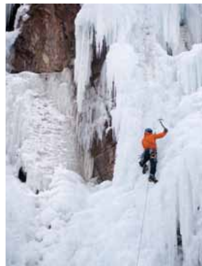
OURAY ICE FESTIVAL

After a killer day threading the Outback glades at Keystone, there are few things more inviting than a mug of hot chocolate and a cozy fireside seat at a rustic mountain lodge. Welcome to Ski Tip Lodge , a throwback bed-and-breakfast tucked away in the hills beyond the buzz of Keystone Village. Aside from the lodge's own rotating four-course dinner menu, guests can enjoy themed wine dinners such as Wines of the