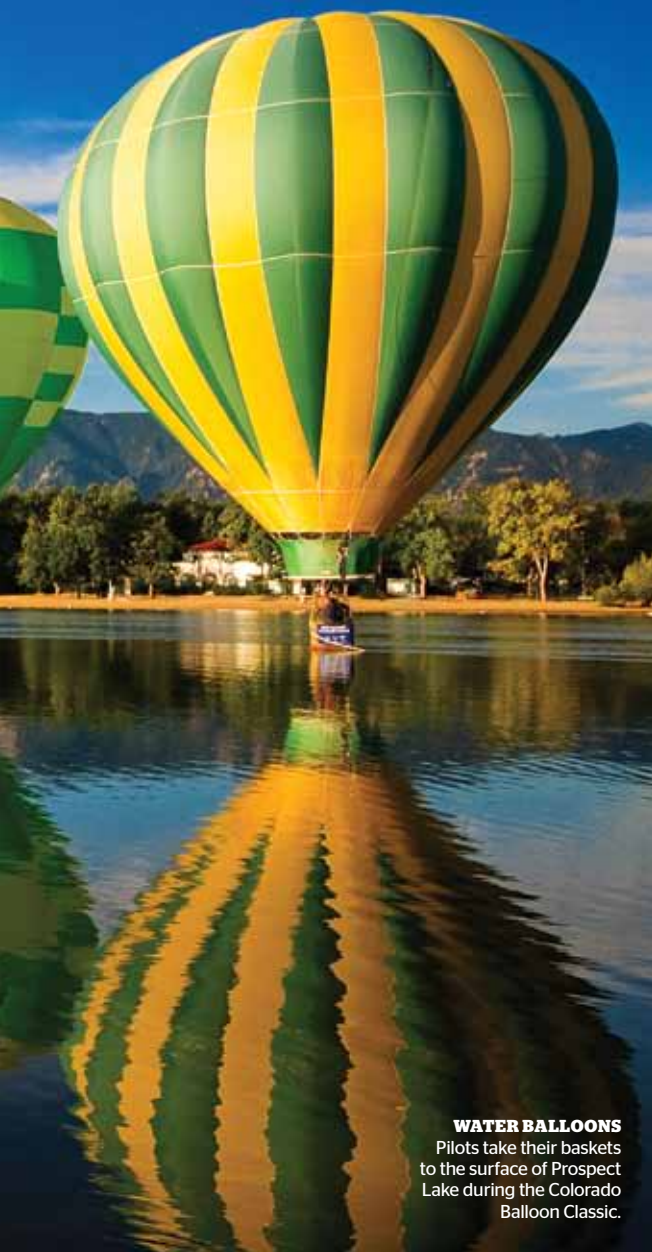
WATER BALLOONS Pilots take their baskets to the surface of Prospect Lake during the Colorado Balloon Classic.