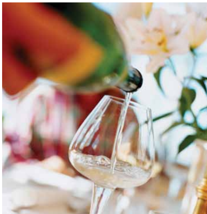
AAA COLORADO'S WINE TRAIN

Dig out the Stetson and boots for a real-deal cowboy experience at Black Mountain Ranch , a family-owned working guest ranch in McCoy, about halfway between Vail and Steamboat Springs. If you're not pleasantly exhausted after your backcountry trail rides, trap shooting, private-pond fly-fishing, and a visit to Steamboat's rodeo on Friday night, Saturday's Texas Longhorn cattle drive will tucker you out. You'll ride along with the wranglers to round 'em up, then learn roping and branding techniques before retiring to the lodge. www.blackmtnranch.com