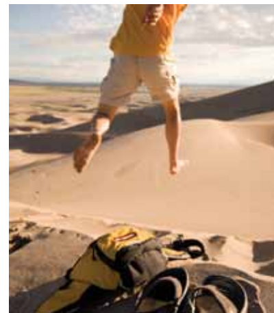
GREAT SAND DUNES

Conundrum Creek Trail is one of Colorado's most revered hike-and-soak destinations, but this jaunt isn't for the fair-weather outdoorsman. At the end of a rigorous 8.5-mile ascent through the Maroon Bells–Snowmass Wilderness are two pools (pssst: clothing optional) fed by natural hot springs. Stake your claim in one of the 13 campsites and melt into a steamy natural bath. For more information, call the Aspen Ranger District at 970-925-3445.