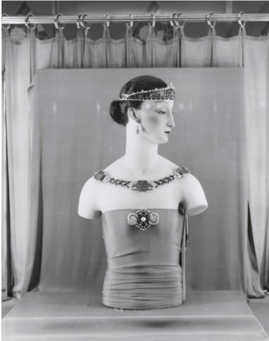
Cartier's Collier Berenice, featuring the Taj Mahal Emerald, on display in Paris at the Exposition internationale des arts décoratifs et industriels in 1925.