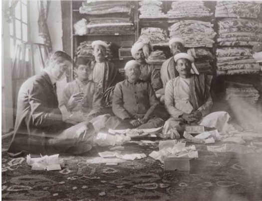
Jacques Cartier in India acquiring gems, 1911.

Commented [KS11]: Who was Jacques Cartier? He is not mentioned in the text?