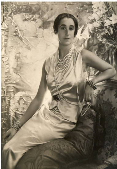
Sybil Sassoon wearing the Art Deco belt buckle, by Cartier.