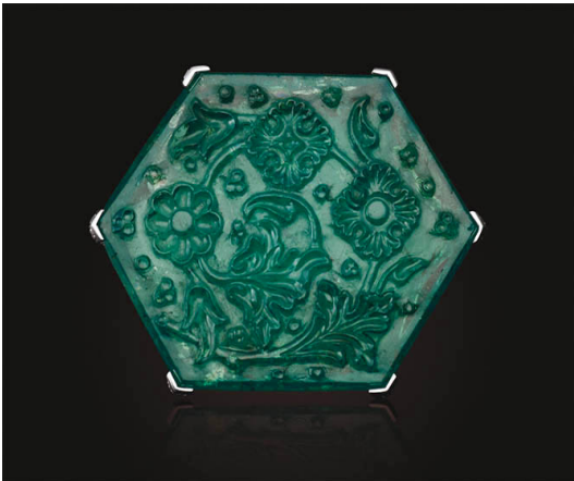
Taj Mahal emerald, 141.13 carats.