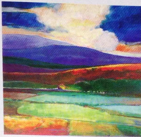
My Neighbor's House #279 24" x 24" Acrylic on Panel