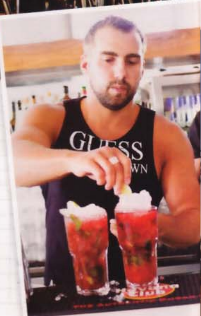
And who said pink drinks weren't manly, bru?

INVITE US TO YOUR LOCAL! Email fhmmail@fhm.co.za