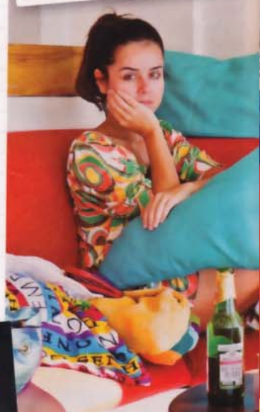
Pretty girls were allowed feet on couches