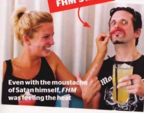
Even with the moustache of Satan himself, FHM was feeling the heat