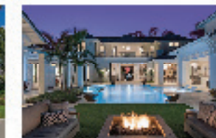
AQUALANE 1801 Gordon Drive $1,305,000