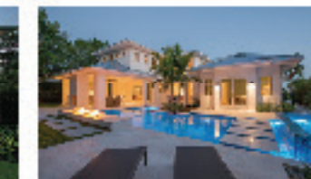
MOORINGS 577 Starboard $3,100,000