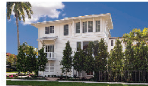
OLD NAPLES 750 10th Street South $3,295,000