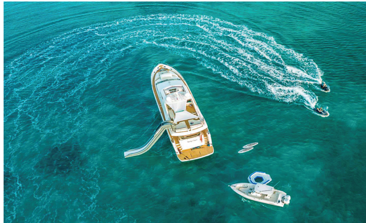
A stay on one of Tropicalboat Luxury Yacht Rentals' vessels offers a generous slice of the good life.

plush velvet booths and chandeliers give the interior a warm, romantic feel. New tables, chairs and kitchen equipment ensure that the food is just as good, while the experience is more luxurious than ever. Address: 837 Fifth Avenue S., Naples. Hours: 5 p.m. to 8:30 p.m., Sunday through Thursday; 5 p.m. to 9 p.m., Friday and Saturday. Website: chopscitygrill.com/