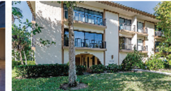
OLD NAPLES - KASOTA SOUTH 1250 Gordon Drive, #D $1,265,000