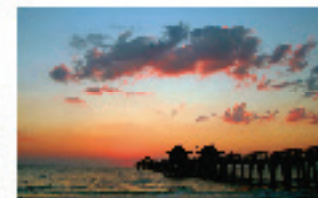
OLD NAPLES 1075 6th Street South $1,100,000