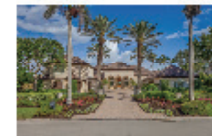
PORT ROYAL 3415 Fort Charles Drive $2,500,000