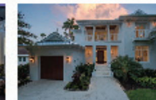
AQUALANE 1788 Gordon Drive $2,305,000