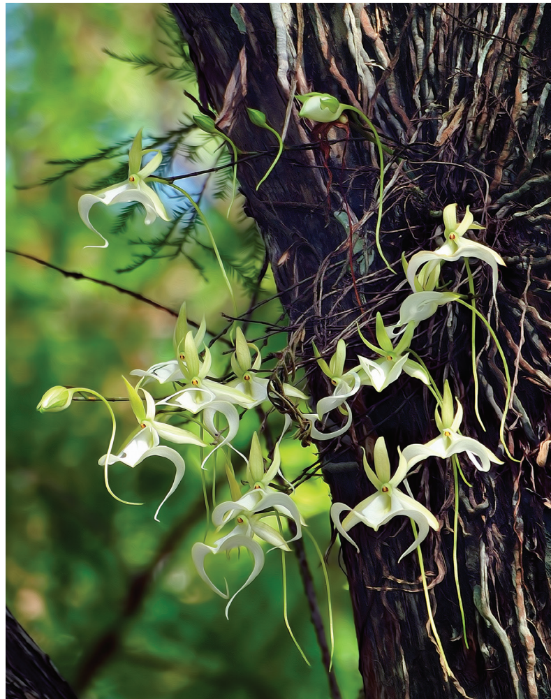
You might spot the rare "super" ghost orchid this summer at Corkscrew Swamp Sanctuary.