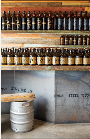
Brassneck's tasting room, growler-fill station and an endless line of taps. (Opposite page) A custom-designed growler from Sigil & Growler shows off Vancouver's beloved landmarks