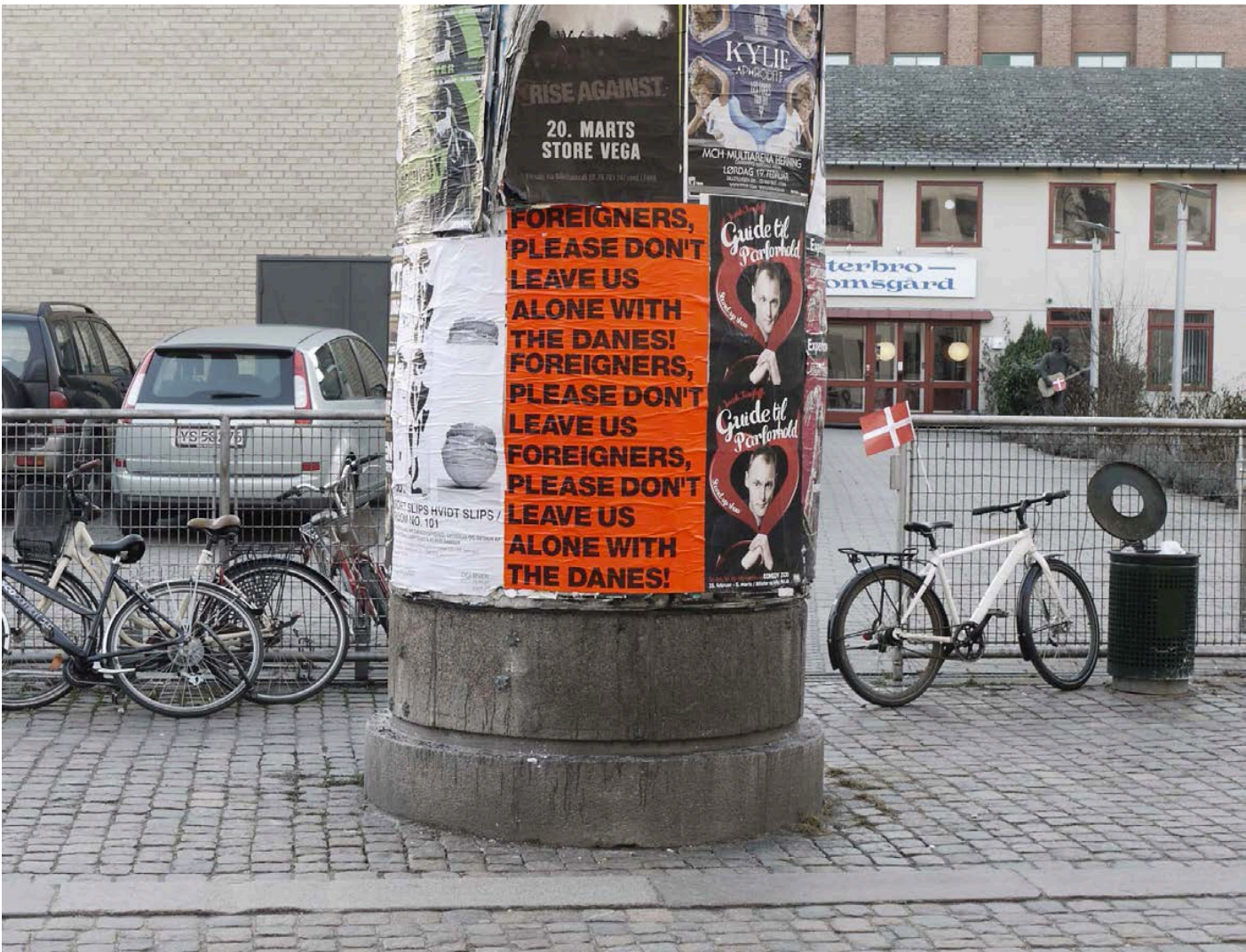
LA BIENNALE ARTE 2024 Stranieri Ovunque Foreigners Everywhere