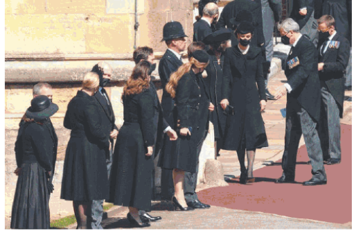
Catherine, Duchess of Cambridge (right) and members of the Royal Family stand outside St George's Chapel.