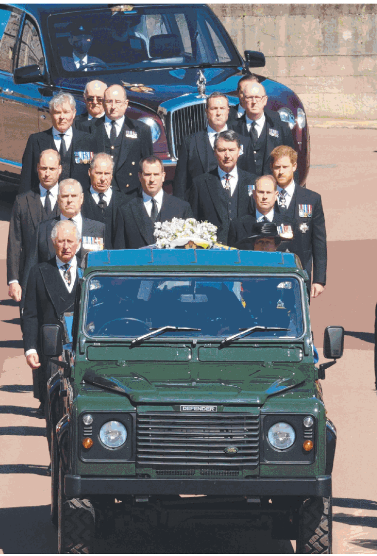
A family united – the senior royals follow the handcrafted hearse to the chapel.