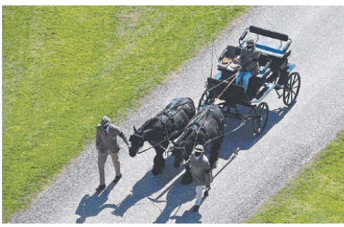
Prince Philip's beloved Fell ponies, Balmoral Nevis and Notlaw Storm, pulling the royal carriage in the procession.