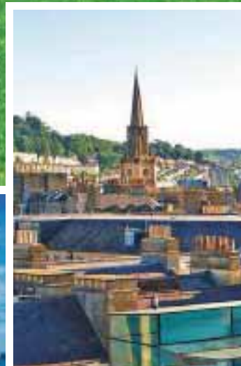
Thermae Bath Spa rooftop pool. Clockwise from left: Newquay’s Great Western Beach; London’s St James’s Park; Chelsea Flower Show festivities in Sloane Square.