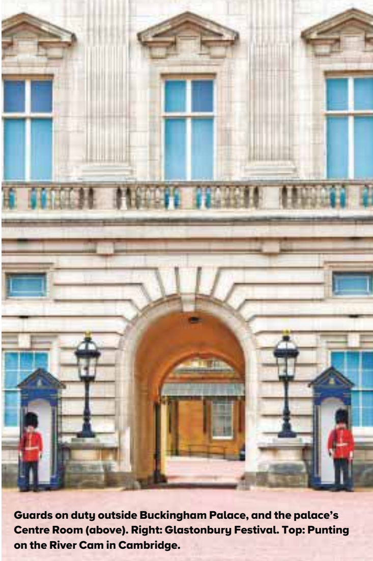
Guards on duty outside Buckingham Palace, and the palace's Centre Room (above). Right: Glastonbury Festival. Top: Punting on the River Cam in Cambridge.

ENGLISH SUMMER TIPS TICKETS: Book as far ahead as possible. There's The London Pass for multiple discounts ( londonpass.com ); The National Trust Touring Pass for visitors ( nationaltrust.org.uk ) and English Heritage Overseas Visitor Pass ( english-heritage.org.uk ). Also go to visitbritainshop.com . HOW TO GET AROUND LONDON: Plan your travel at tfl.gov.uk and pre-order a Visitor Oyster Card through Visit Britain shop. You can use contactless and ApplePay on public transport. HOW TO GET AROUND ENGLAND: The easiest way is by train. Pre-book journeys at nationalrail.co.uk for significantly-reduced fares. There's also a BritRail pass for visitors, britrail.com . HOW TO GET THERE: Airlines including Qantas, British Airways, Singapore Airlines, Emirates and Etihad fly to the UK from Australia, to multiple cities, including London, Manchester and Birmingham. FOR MORE INFO: visitengland.com ; visitbritain.com