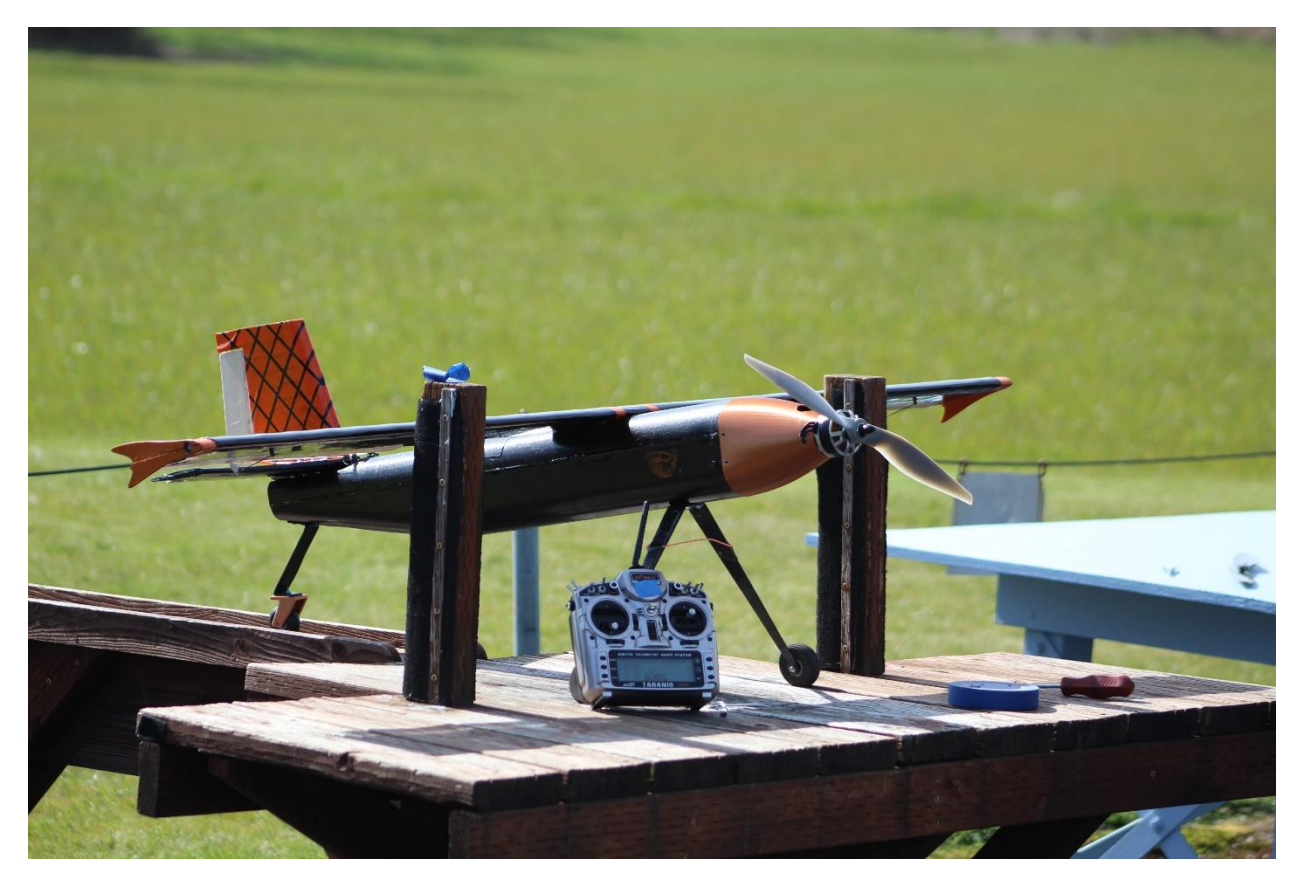
3: Final Aircraft with full fiberglass fuselage