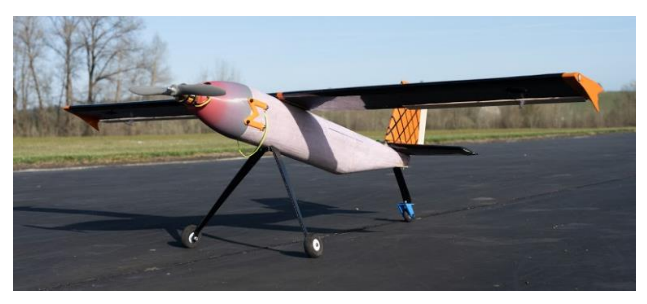
2: Next prototype with carbon fiber wing and landing gear, and symmetrical air foil empennage