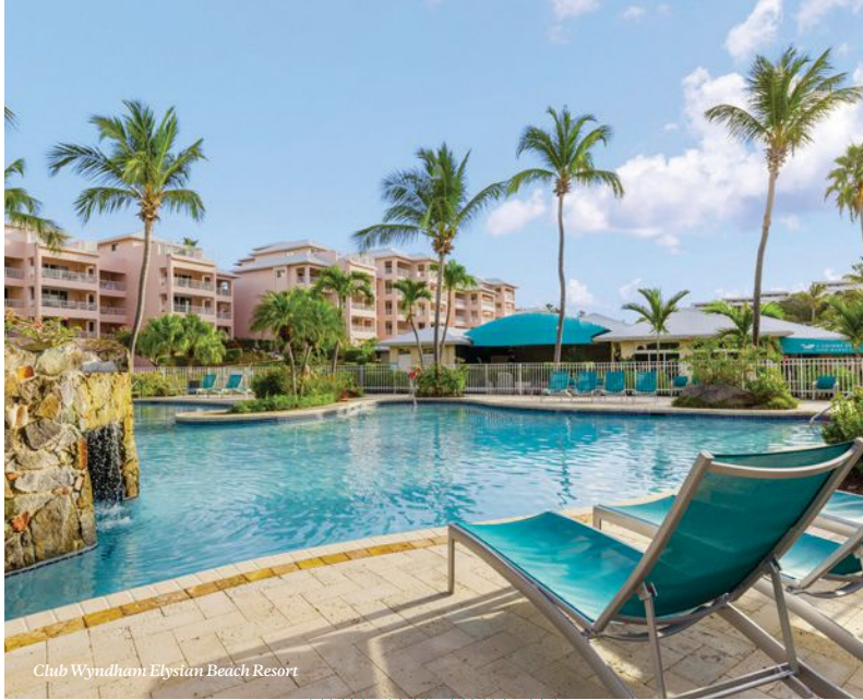
Club Wyndham Elysian Beach Resort