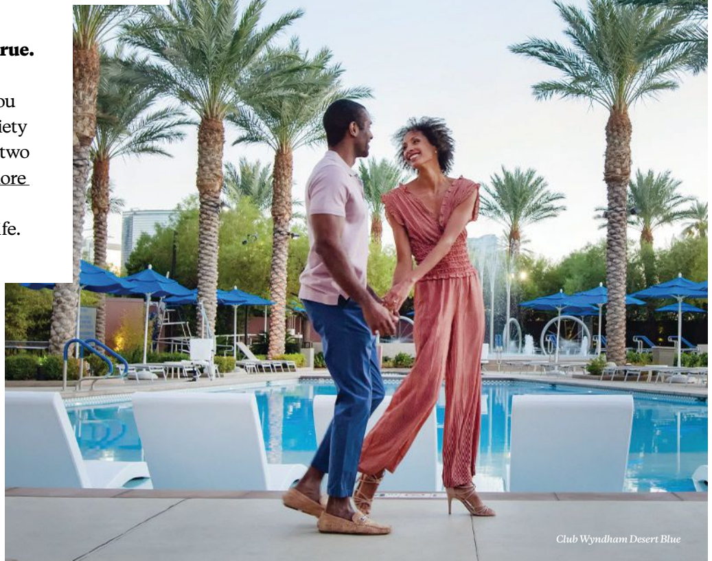
Club Wyndham Desert Blue

» While casinos and world-class shows are among the more popular attractions when staying at Club Wyndham Desert Blue , this scintillating city offers opulent experiences for guests seeking a posh Las Vegas getaway. Sip a handcrafted cocktail while lounging inside a giant crystal chandelier at The Cosmopolitan . Go all in with an extravagant supercar driving experience with Exotics Racing . Pamper yourself with an Aromatherapy Massage at The Spa at Encore or a signature retreat in the world's only Arctic Ice Room at Qua Baths & Spa .