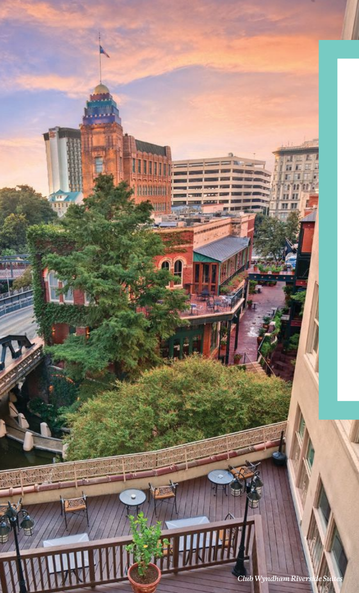
Club Wyndham Riverside Suites