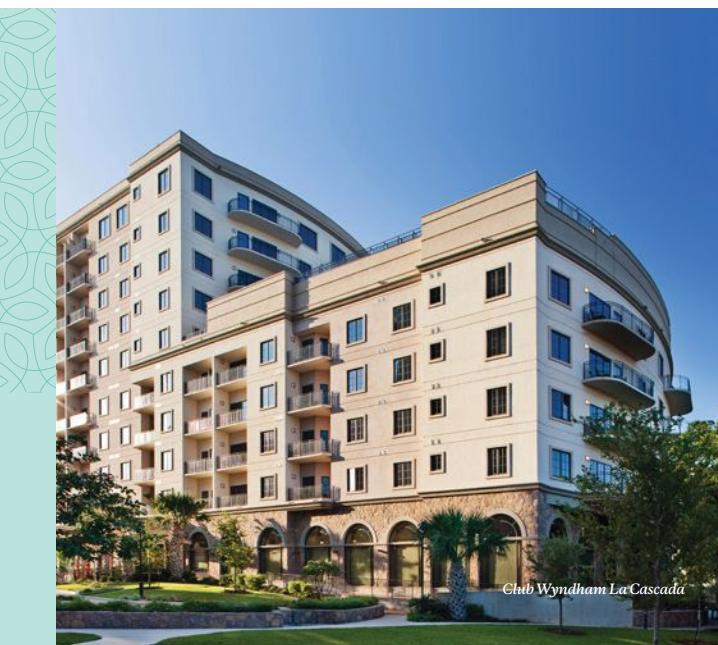
Club Wyndham La Cascada

CLUB WYNDHAM LA CASCADA Enjoy on-site amenities like the resort's rooftop sundeck, outdoor swimming pool, and sunbathing area.