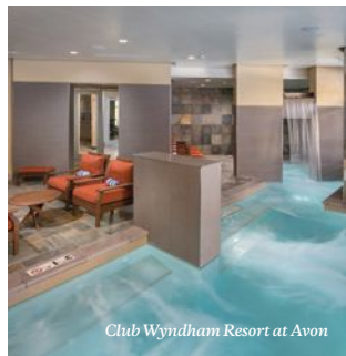
Club Wyndham Resort at Avon