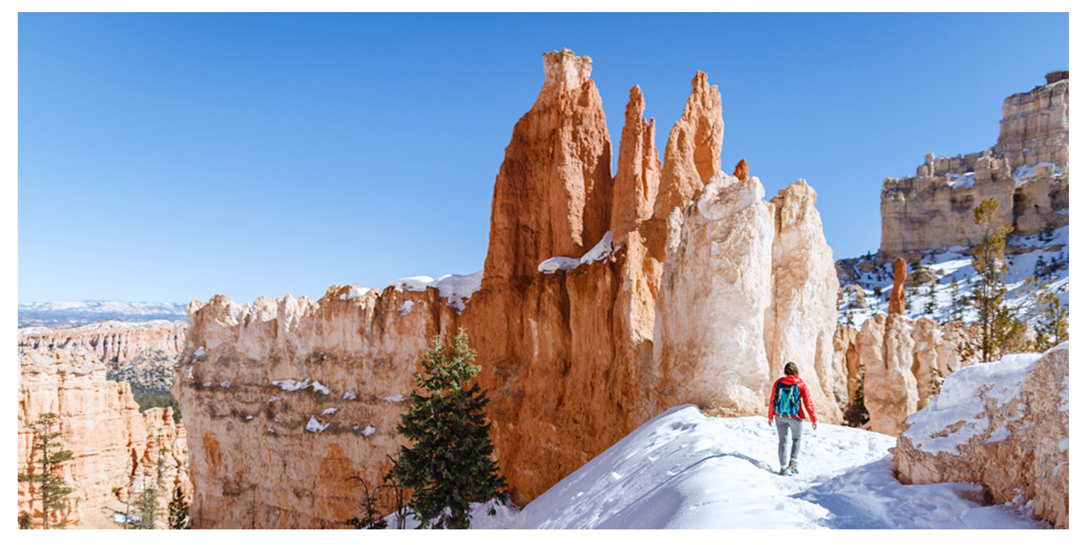
Hike the hoodoos of Bryce Canyon National Park during your stay at WorldMark St. George through Wyndham Club Pass. »