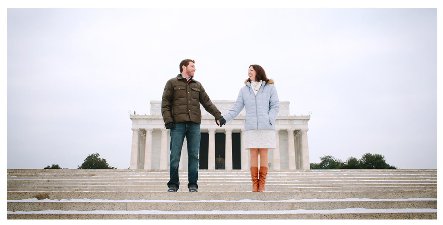
The Lincoln Memorial is a must-see during any Washington, D.C. trip. Stay at Club Wyndham National Harbor or Club Wyndham Old Town Alexandria. »