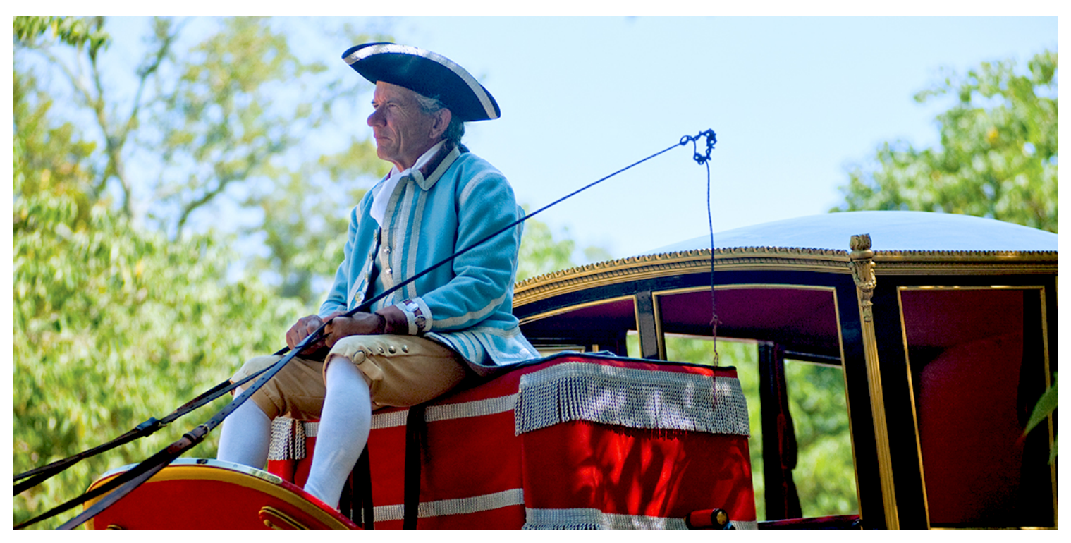
During your trip to Club Wyndham Governor's Green, Club Wyndham Kingsgate, or Club Wyndham Patriots' Place, you'll feel like you're transported back in time. »