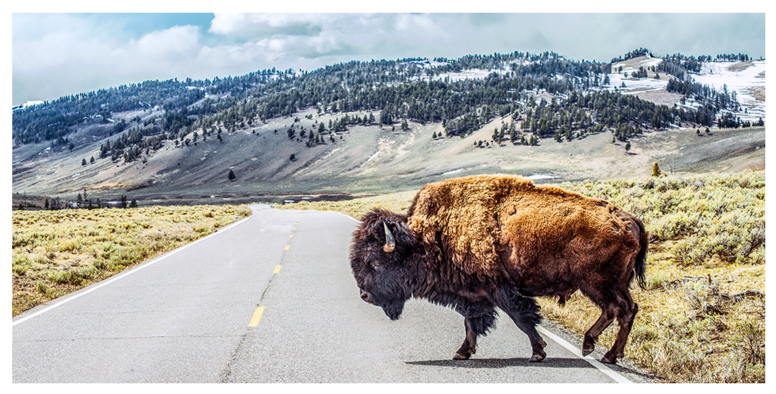
Spot bison in Yellowstone National Park during your stay at WorldMark West Yellowstone through Wyndham Club Pass. »