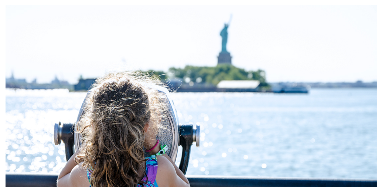
If you can't visit Ellis Island, you can spot it from the mainland along with the Statue of Liberty during your vacation at Club Wyndham Midtown 45. »