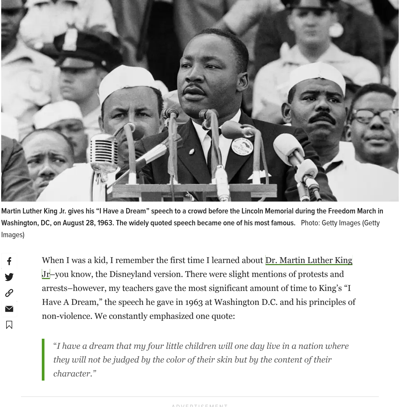
Martin Luther King Jr. gives his "I Have a Dream" speech to a crowd before the Lincoln Memorial during the Freedom March in Washington, DC, on August 28, 1963. The widely quoted speech became one of his most famous.