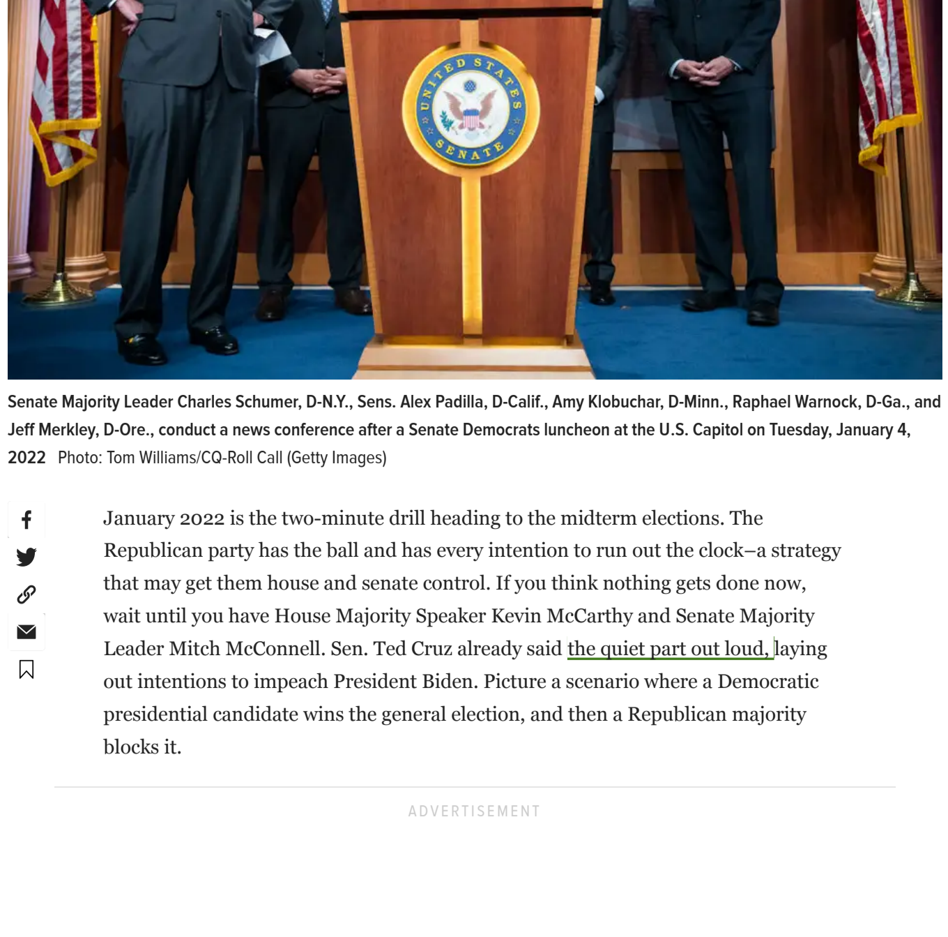
Senate Majority Leader Charles Schumer, D-N.Y., Sens. Alex Padilla, D-Calif., Amy Klobuchar, D-Minn., Raphael Warnock, D-Ga., and Jeff Merkley, D-Ore., conduct a news conference after a Senate Democrats luncheon at the U.S. Capitol on Tuesday, January 4, 2022.