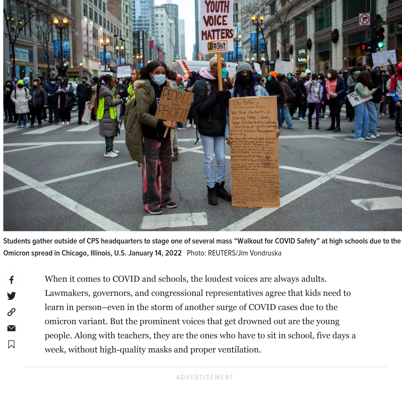
Students gather outside of CPS headquarters to stage one of several mass "Walkout for COVID Safety" at high schools due to the Omicron spread in Chicago, Illinois, U.S. January 14, 2022.

The topic of in-person learning is often framed around the adults when we should also be listening to the kids. By Murjani Rawls 2/22 10:45AM | Comments (47) | Alerts