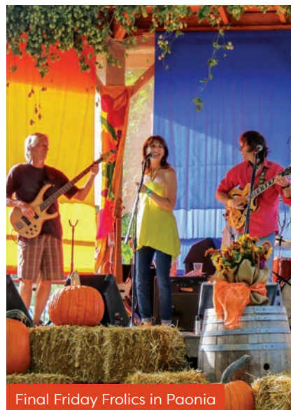
Final Friday Frolics in Paonia

Explore all 23 of Colorado's Certified Creative Districts at COLORADO.com/CreativeDistricts .