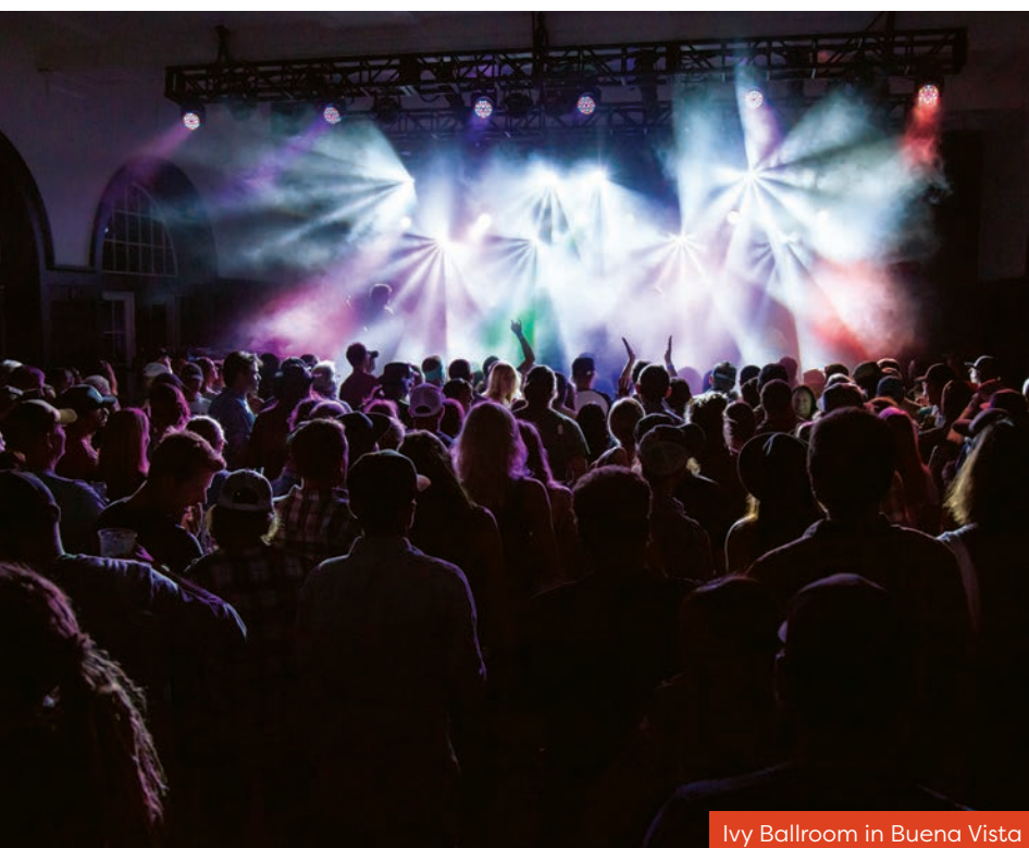
Ivy Ballroom in Buena Vista