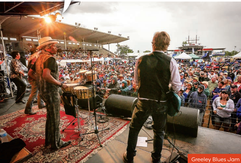
Greeley Blues Jam

Hey you rock-and-rollers, blues travelers, festival goers and everyone in between: Here's an inside look at where to experience all things musical in the Centennial State — from stages in the smallest of settings to seeking your favorite summer headliners.