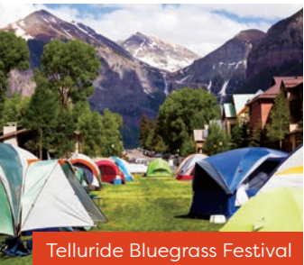
Telluride Bluegrass Festival

Certain multi-day occasions welcome campers to stay for the duration, including the Telluride Bluegrass Festival (June 20–23, 2019) and Buena Vista's Seven Peaks Music Festival (Aug. TBA, 2019).