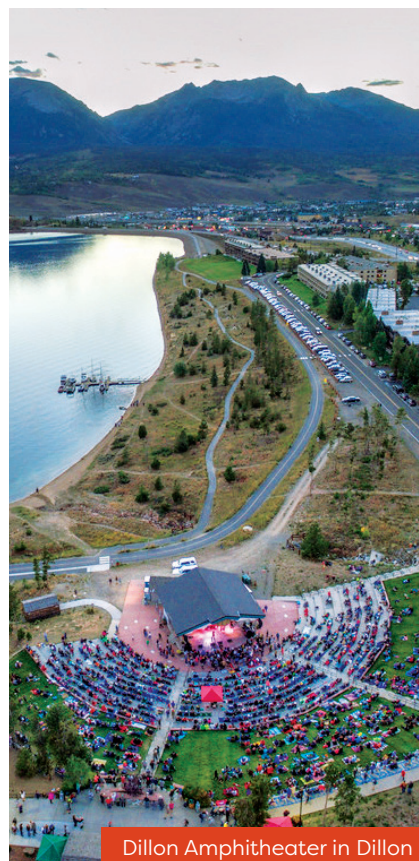
Dillon Amphitheater in Dillon

FROM LEFT: SURF HOTEL/LACI MONTROSE; DILLON AMPHITHEATER.