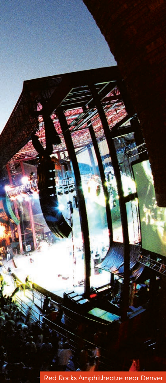
Red Rocks Amphitheatre near Denver

Post-show nightcap: Tap and Handle in Fort Collins