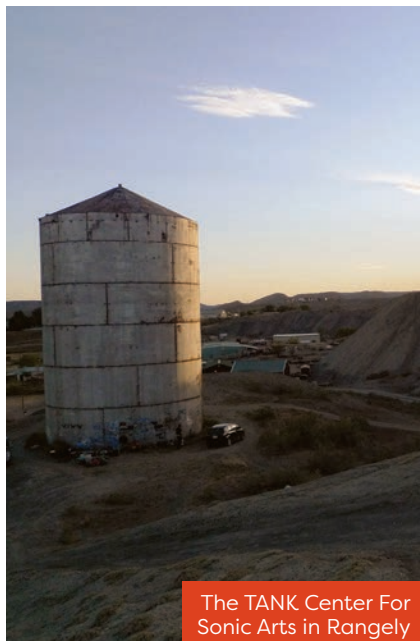
The TANK Center For Sonic Arts in Rangely