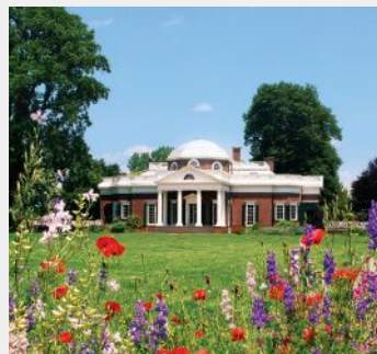
From top: Shenandoah National Park, Virginia Beach, Thomas Jefferson's home, Monticello