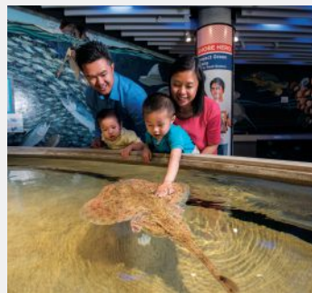
Clockwise from top: Chesapeake City, Adobe Stock; Ocean City, Visit Maryland/Helen Norman; The National Aquarium; Calvert Marine Museum, Visit Maryland/Helen Norman.