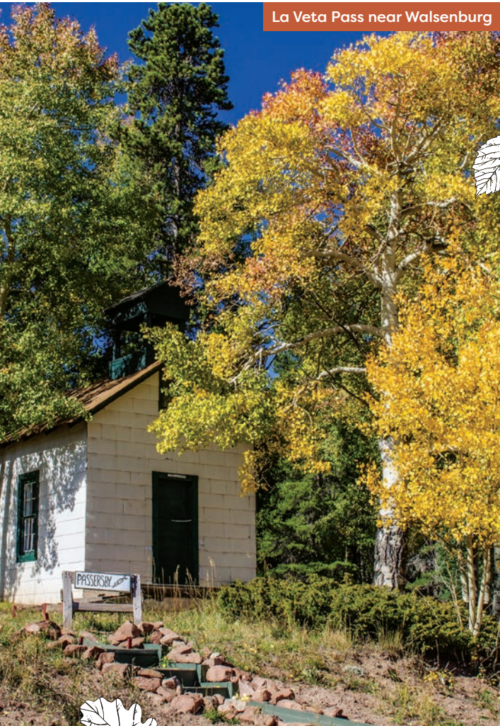
La Veta Pass near Walsenburg