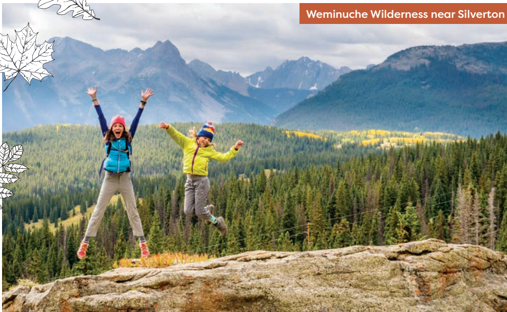
Weminuche Wilderness near Silverton

Peaking at an altitude of more than 9,400 feet, La Veta Pass in southern Colorado (west of the town of La Veta ) is one of the most scenic drives in the state during the fall season. Gold aspen trees mixed with dark green pines line the pass, while the magnificent Spanish Peaks and Sangre de Cristo Mountains tower over the foliage of the San Luis Valley. The Rio Grande Scenic Railroad (May to October) passes through mountain meadows, canyons and colorful foothills otherwise inaccessible by cars.