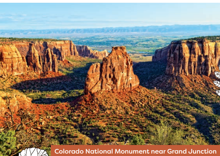
Colorado National Monument near Grand Junction