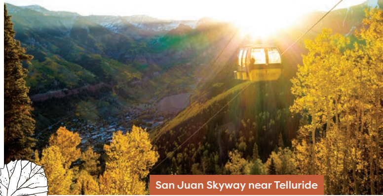
San Juan Skyway near Telluride